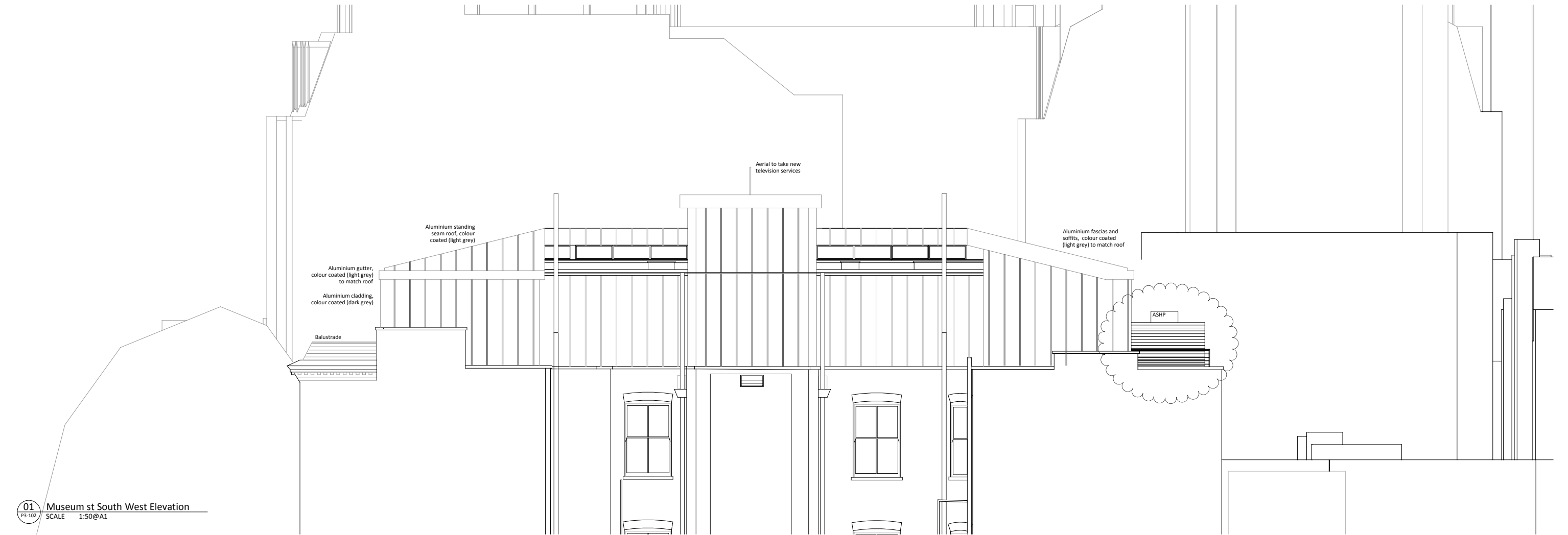
01 Museum st South West Elevation SCALE 1:50@A1

NOTES CONSULTANTS - Refer to highways consultant's drawings for details - Refer to landscape consultant's drawings for details - Landscaping layout is indicative only AREAS - Refer to area schedule PLANNING © Copyright Reserved. ColladoCollins Partners LLP