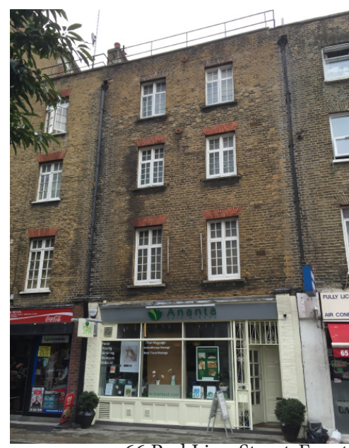
66 Red Lion Street-Front

Close to the building in Red Lion Street there are very different styles of buildings which are mixed with others more similar to n.66. For example,