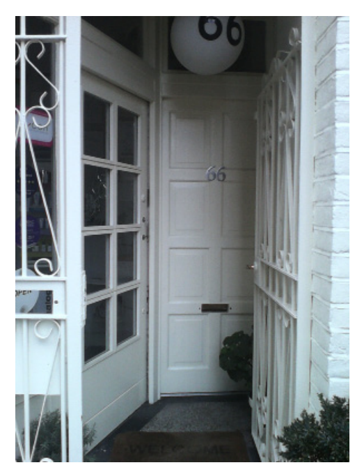
66 Red Lion Street-Entrance