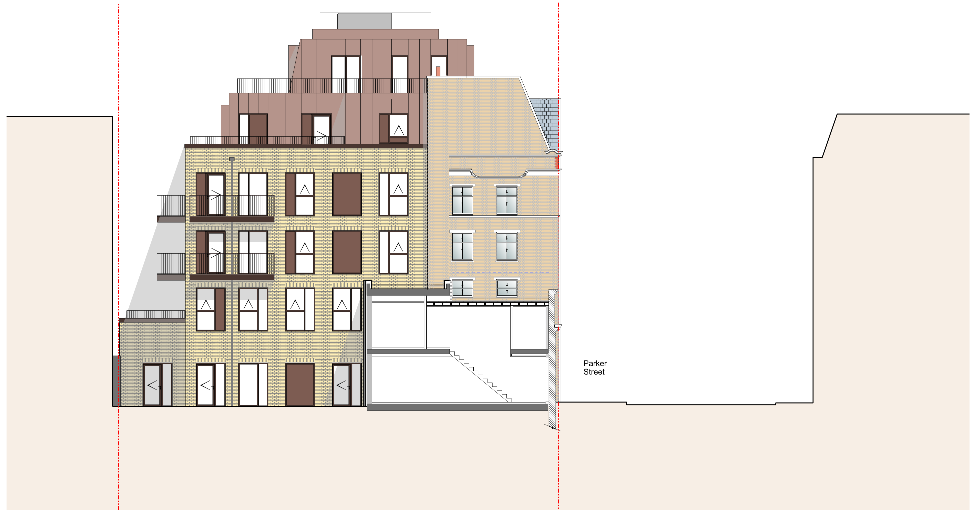
01 South West Elevation F-F 1:100