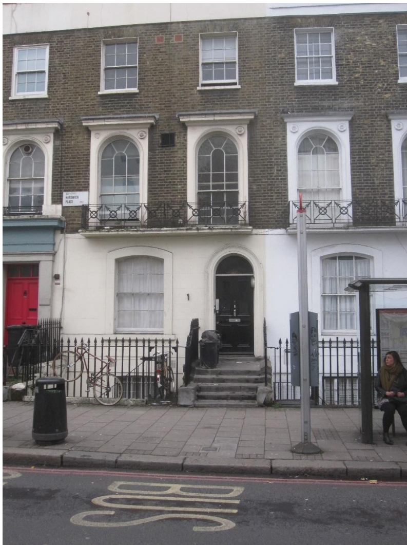
Fig 1. – Photograph of No. 2 Hurdwick Place.