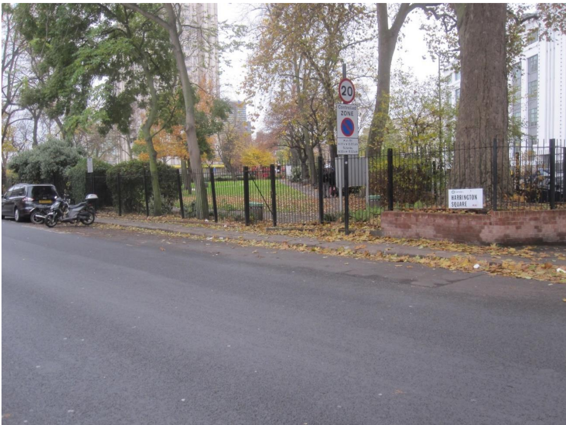
Fig 7 – Photograph of Residents Parking Bay in Harrington Square.