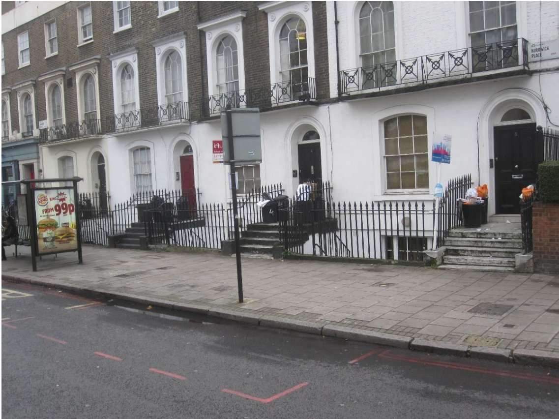
Fig. 4 – Photograph showing single, shared-use parking bay outside No. 5 Hurdwick Place.