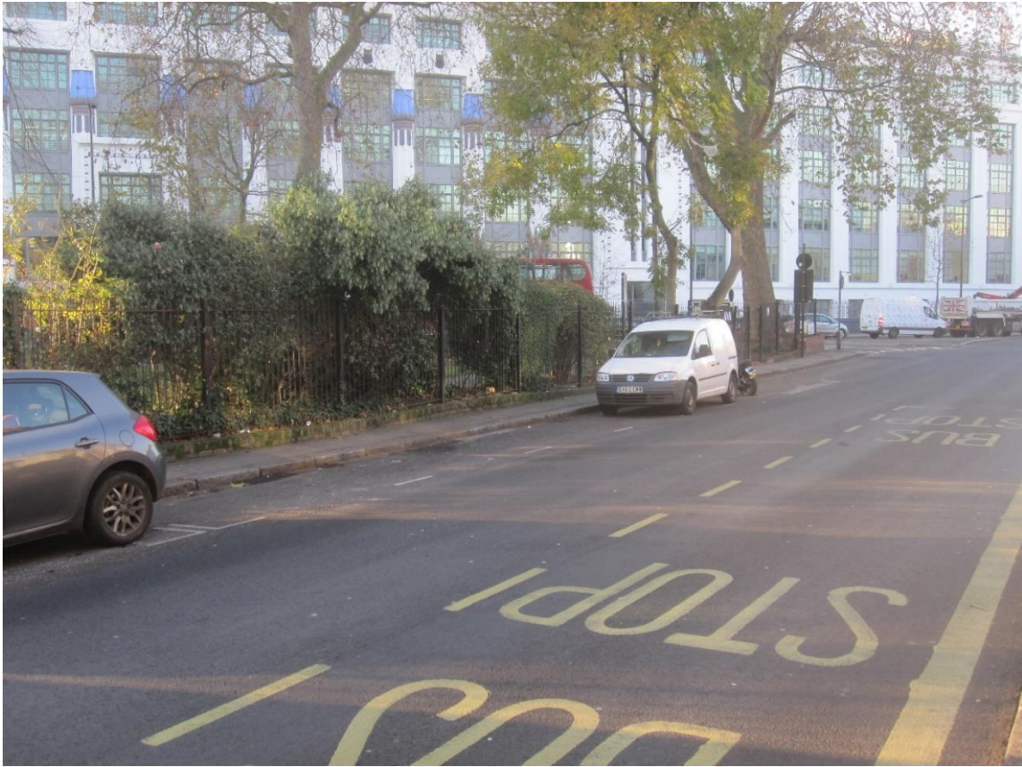
Fig. 8 – Photograph of Residents Parking Bay in Harrington Square.