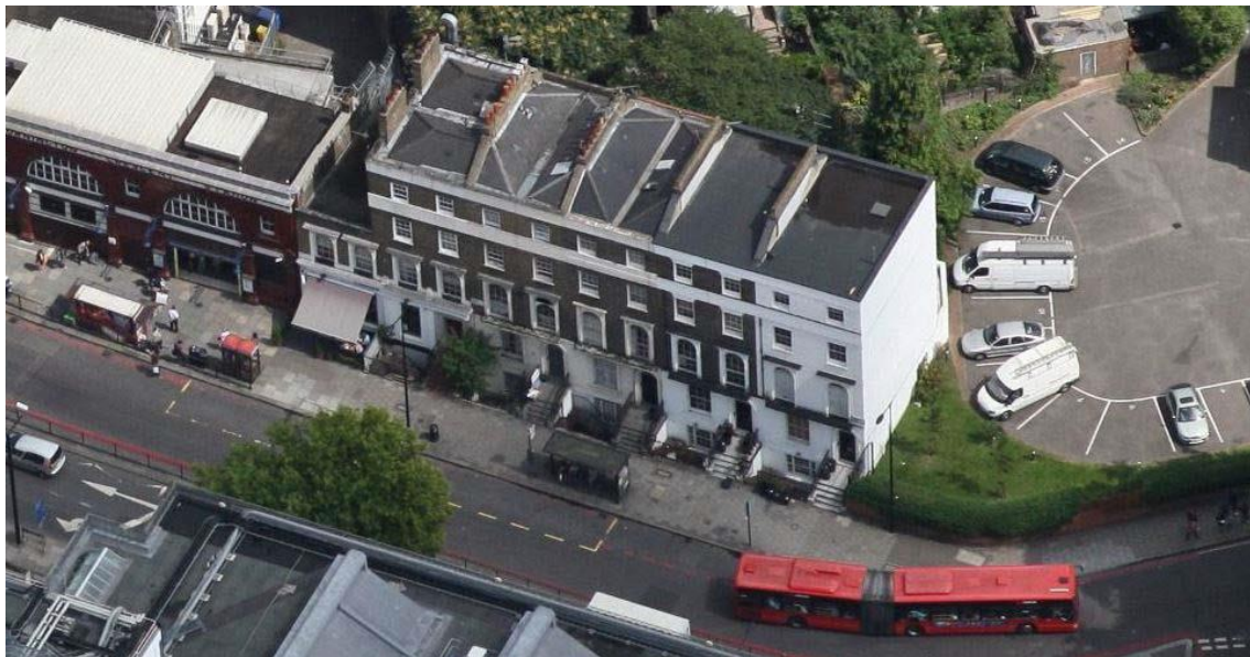
Fig. 3. – Photograph depicting Bus Stop, Bus Shelter, shared-use Parking Bay, Adjacent land car Park.