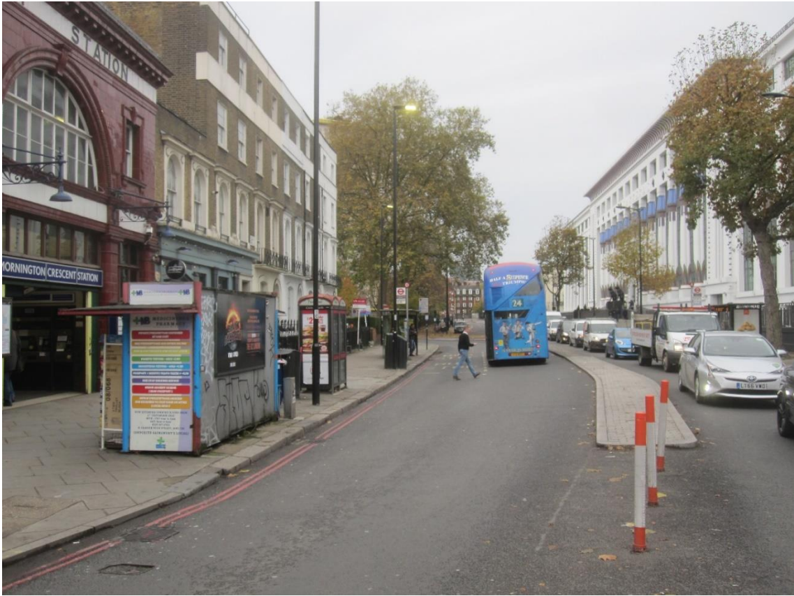
Fig 6. – Photograph showing space for bus to pass by any potential Bus Stop usage.