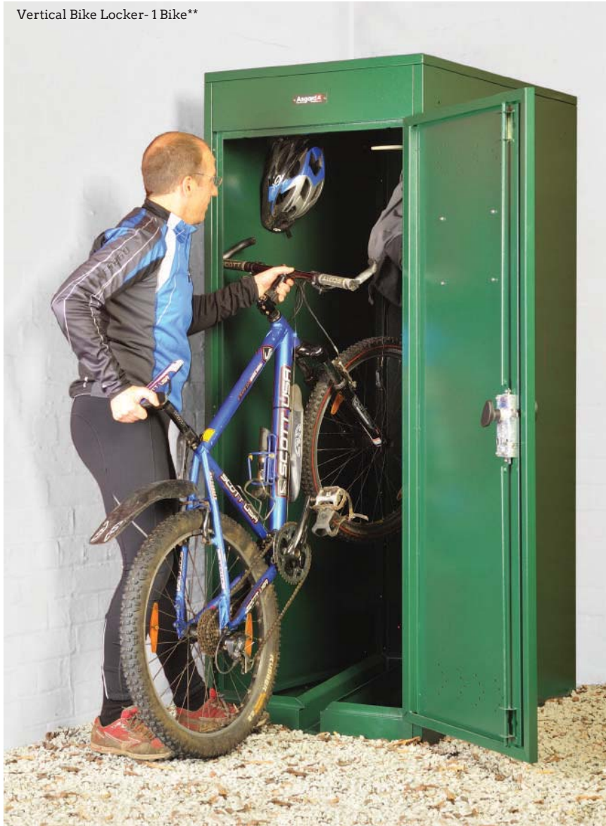
Vertical Bike Locker- 1 Bike**