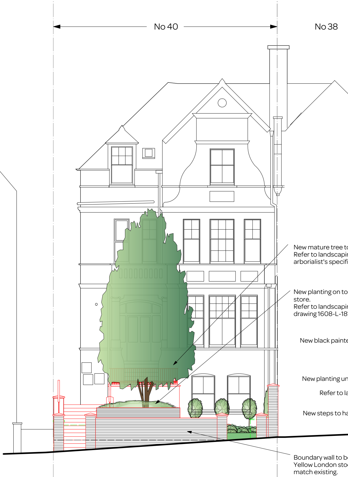
PROPOSED STREET SCENE