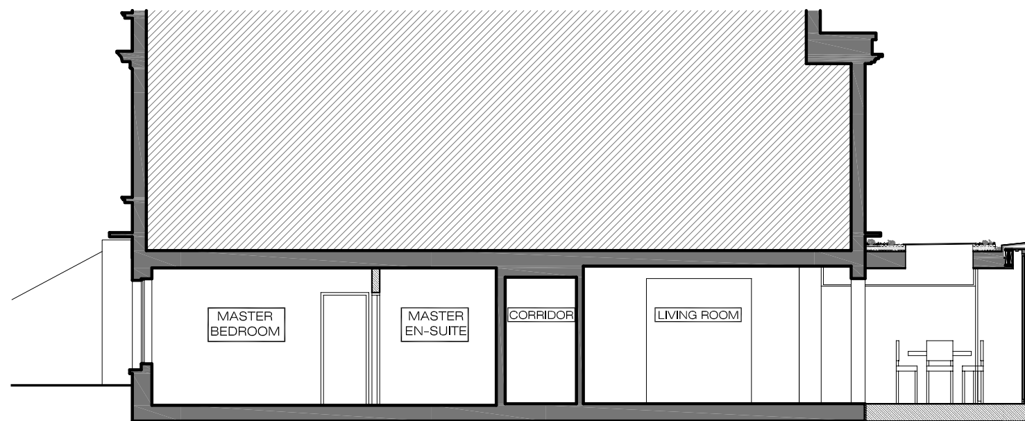
PROPOSED Section AA SCALE 1:50@A1 PA-04