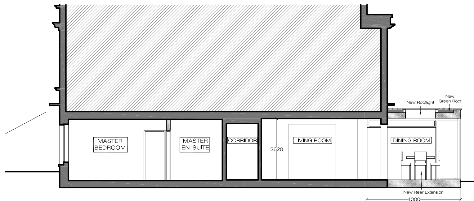
APPROVED Section AA SCALE 1:50@A1 AP-04