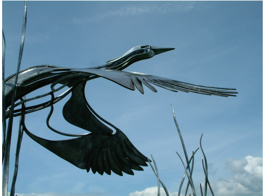
Great Ormond Street Hospital Roof Top. River Banks and Lakes, Taking flight.

Rev A - 4/8/15 additional fish, reeds and ripples Rev B - 6/3/16 Rotate the swan, reeds and ripples by 5 degrees. Move the right hand group of ripples in by 1372mm to support the swan wing and help align fixing stubs.