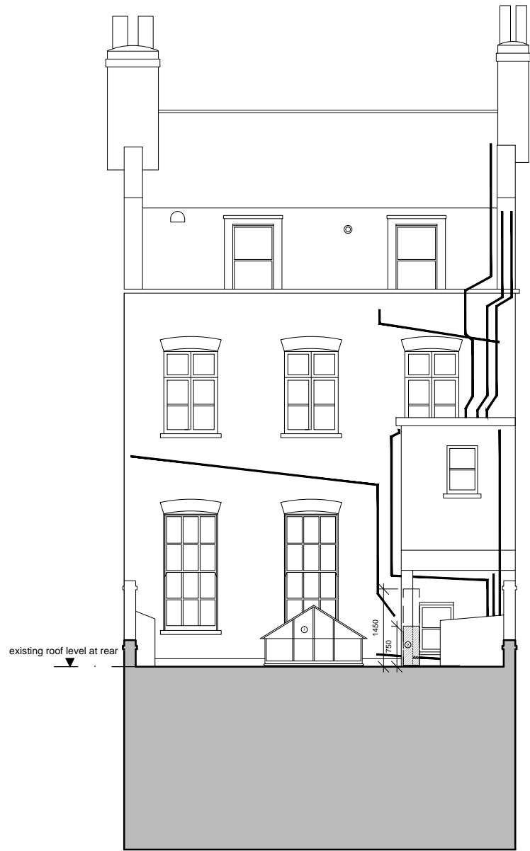
REAR ELEVATION @ 1:100