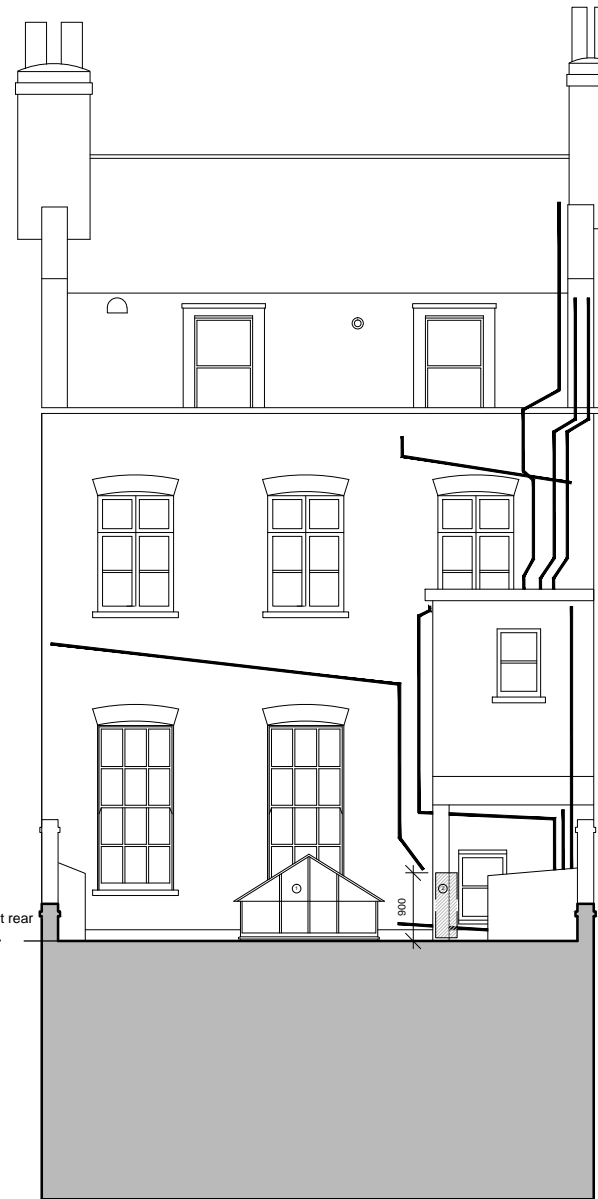
REAR ELEVATION @ 1:100

Report any discrepancies in writing to Palmer Lunn Architects before proceeding.