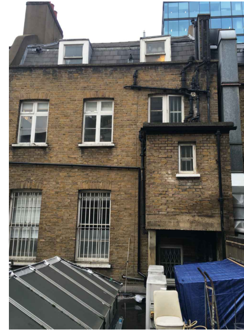
view of rear of no. 15, the site