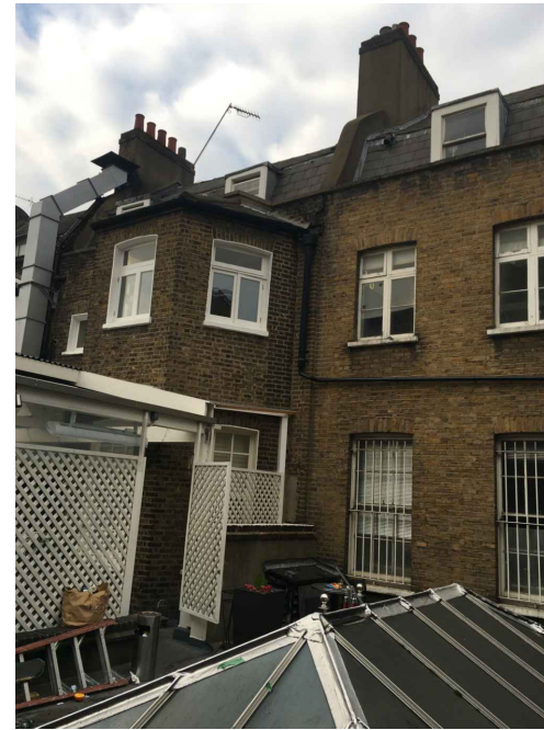
view of rear looking towards no. 14