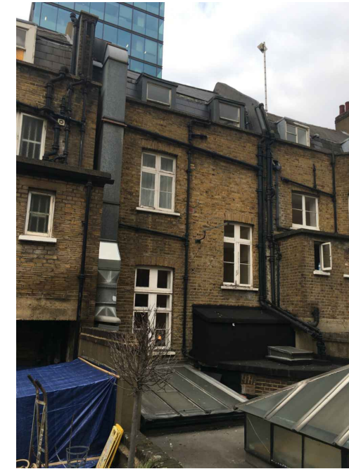
view of rear looking towards no. 16