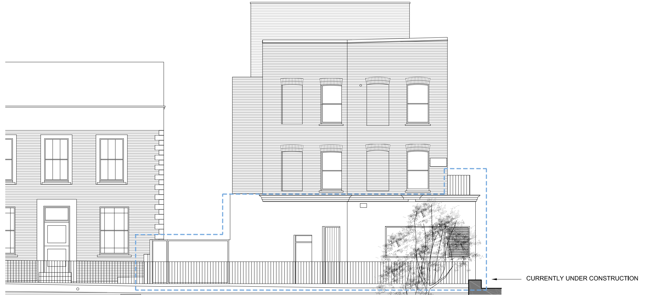
01 Elevation 3 - Lyme Terrace