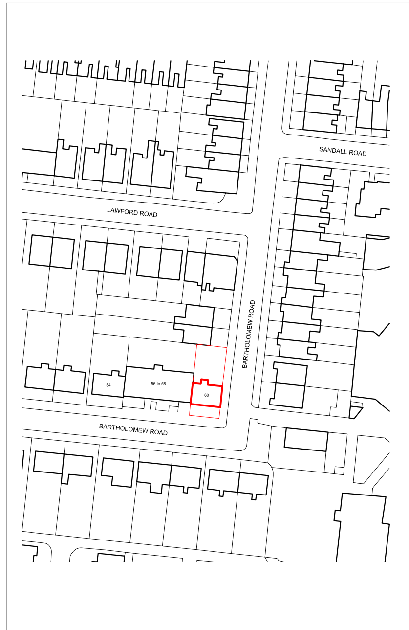
SITE PLAN 1:1250