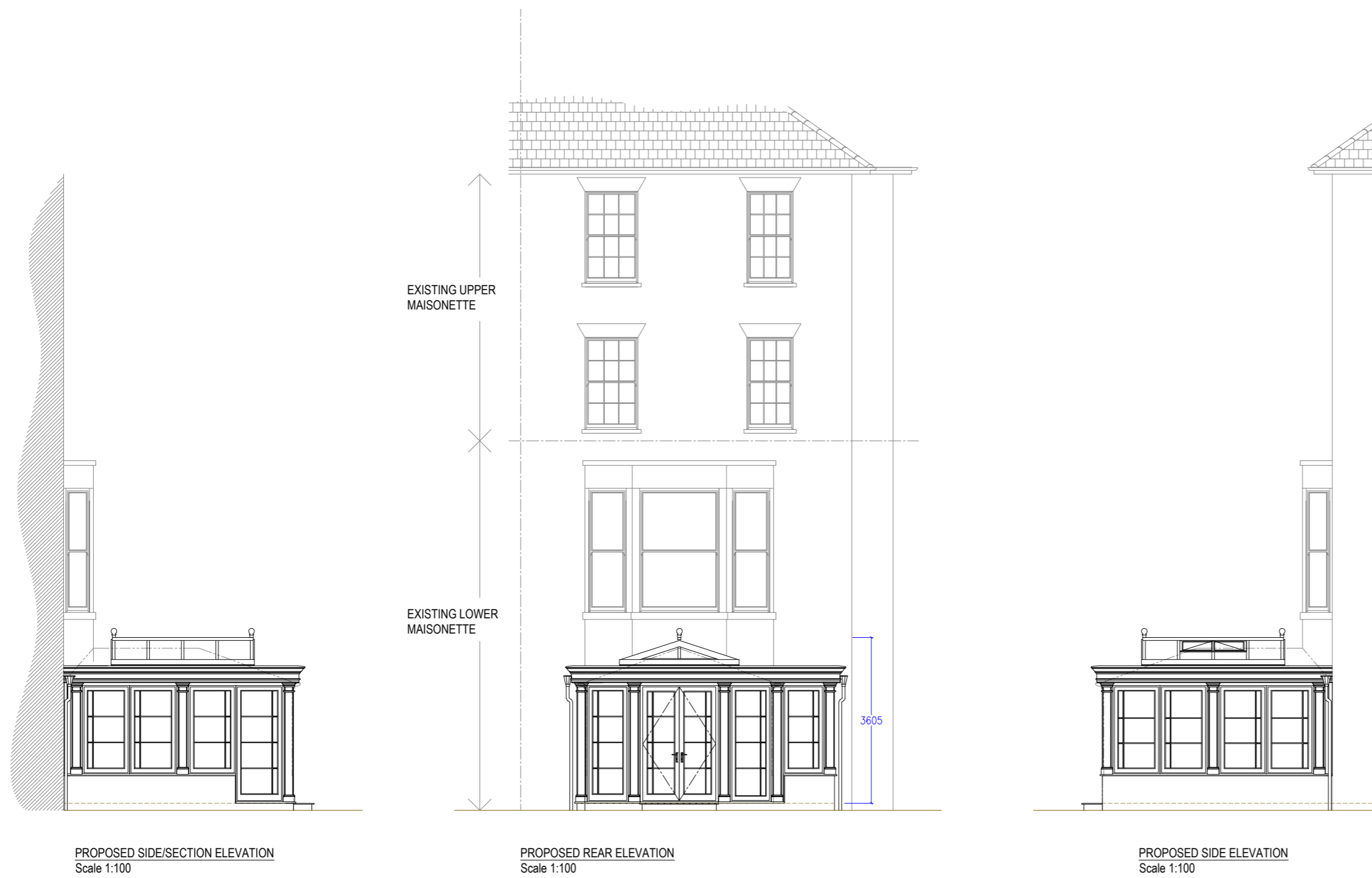
PROPOSED SIDE/SECTION ELEVATION Scale 1:100