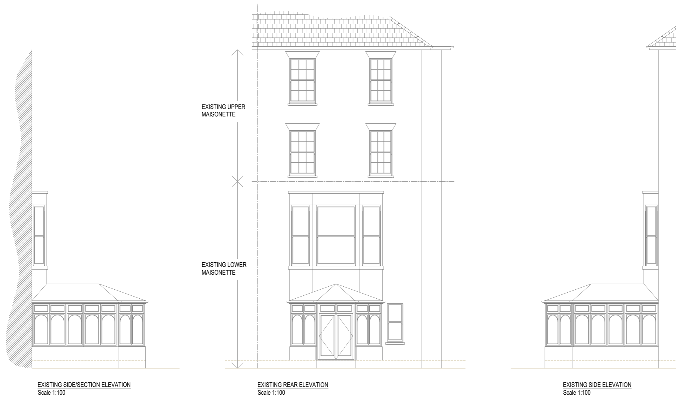
EXISTING SIDE/SECTION ELEVATION Scale 1:100