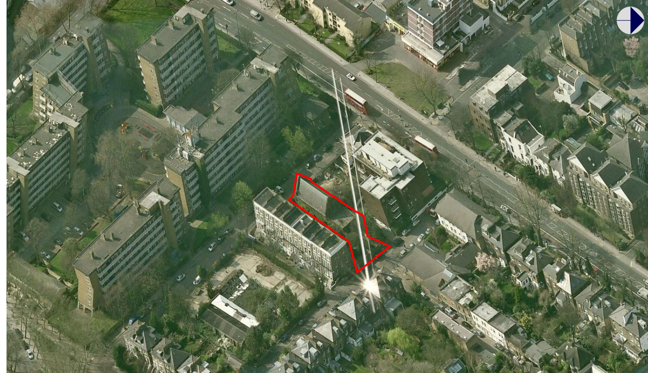
Aerial View looking east towards proposed development site