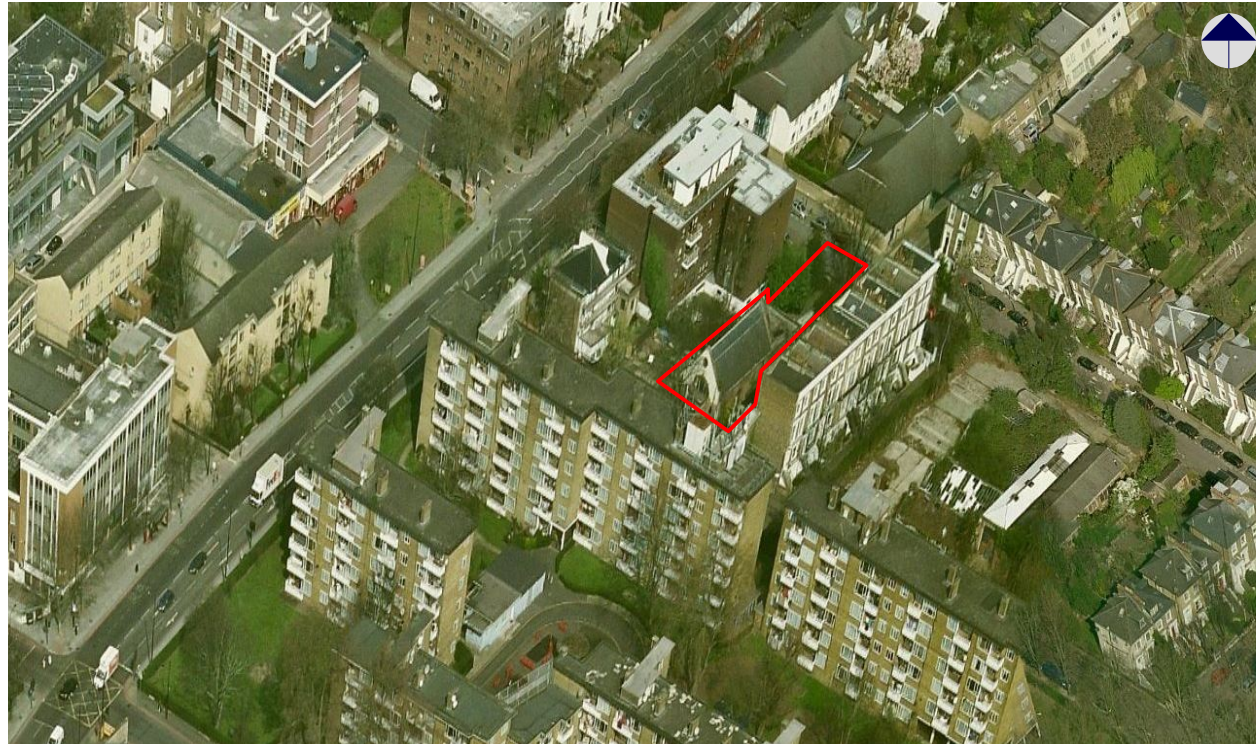
Aerial View looking north towards proposed development site