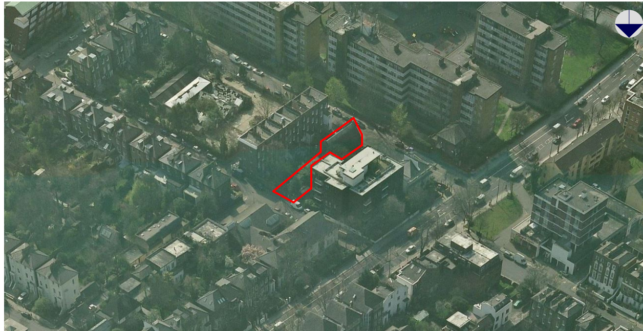
Aerial View looking south towards proposed development site