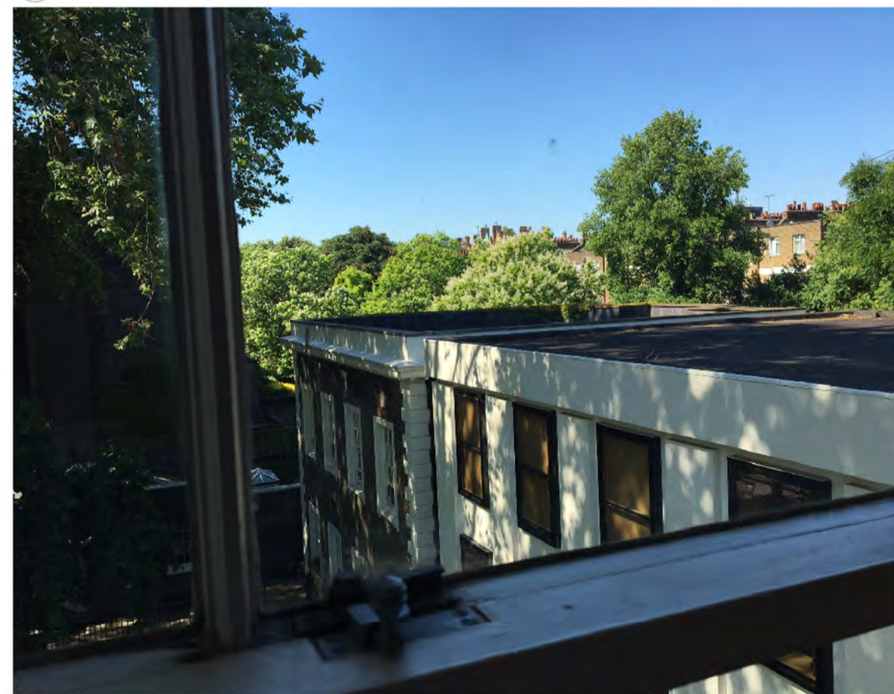
3 Image three is taken from the third floor office