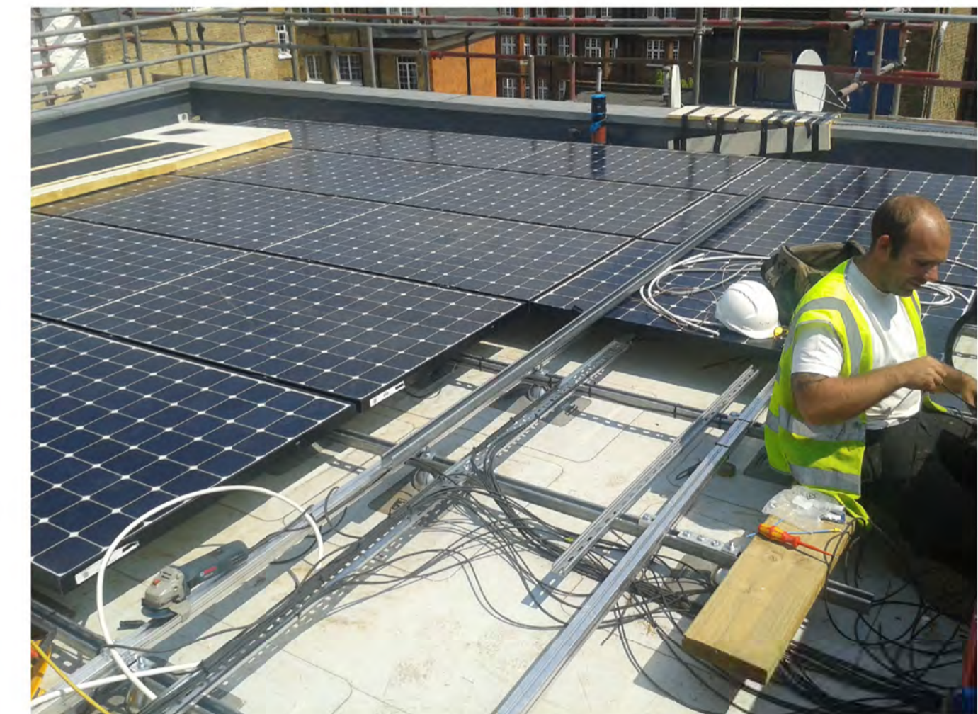
Image of installed PV panels

THIS DRAWING AND CAD DATA THEREIN IS PROTECTED BY COPYRIGHT AND MUST NOT BE COPIED OR REPRODUCED WITHOUT THE WRITTEN CONSENT OF DLG ARCHITECTS © NO DIMENSIONS ARE TO BE SCALED FROM THIS DRAWING. USE FIGURED DIMENSIONS ONLY. ALL DIMENSIONS AND SIZES ARE TO BE CHECKED ON SITE AND ANY DISCREPANCIES REPORTED TO THE ARCHITECT PRIOR TO INITIATION OF ANY WORKS.