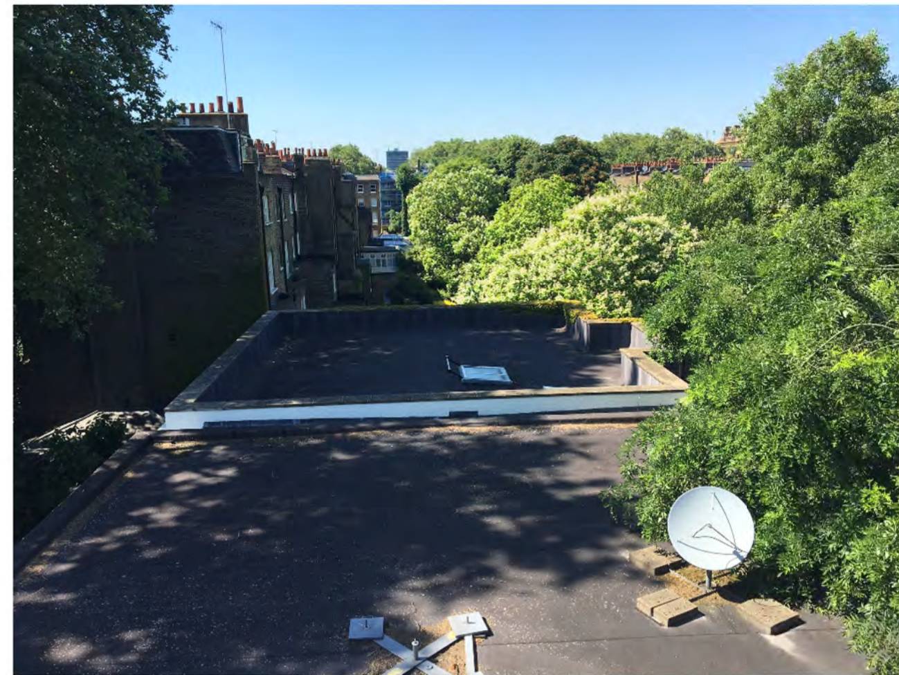
1 Image one is taken from the roof