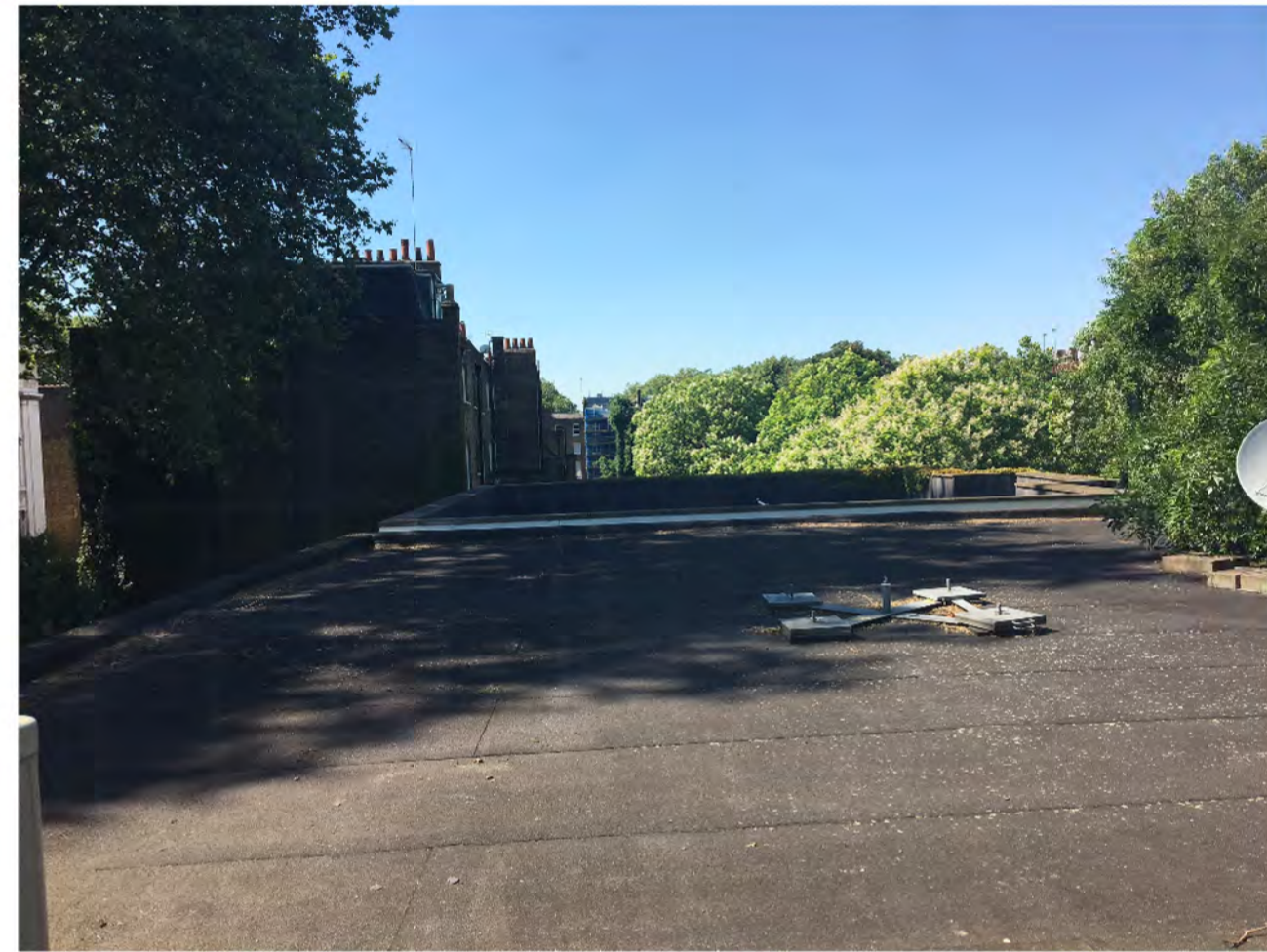
2 Image two is taken from the staircase at half landing