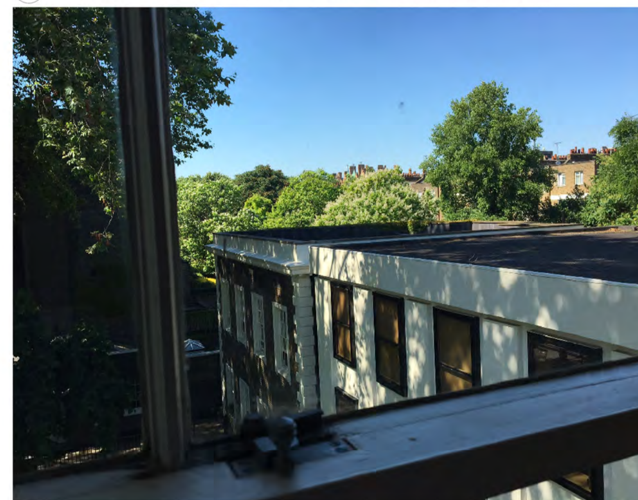
3 Image three is taken from the third floor office