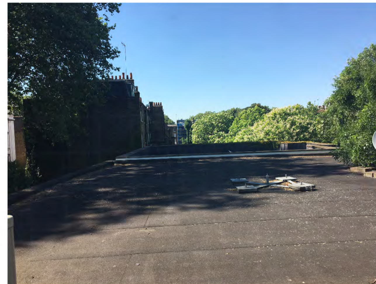
2 Image two is taken from the staircase at half landing