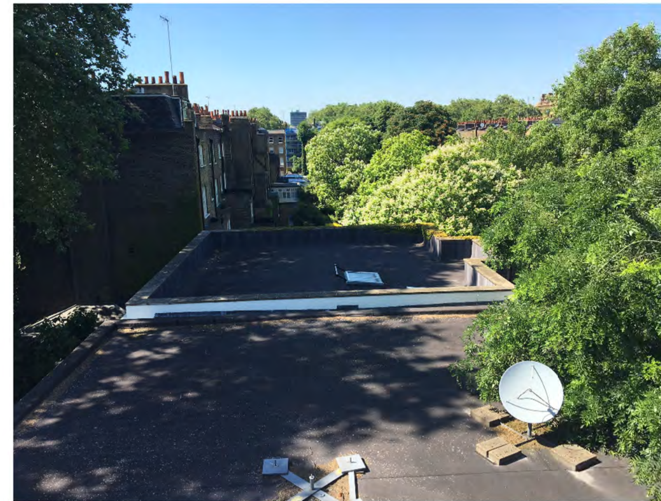
1 Image one is taken from the roof