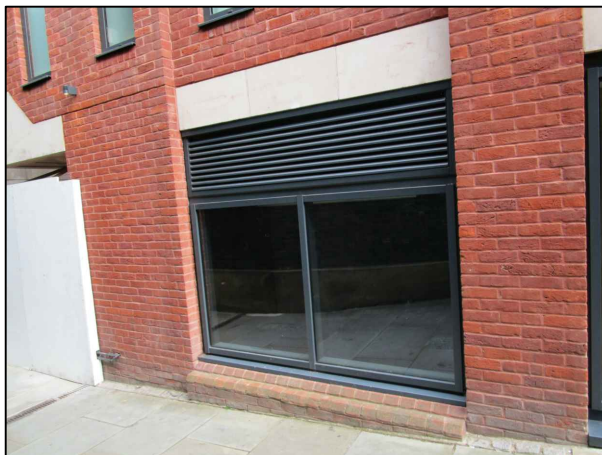
Photograph showing window to be altered