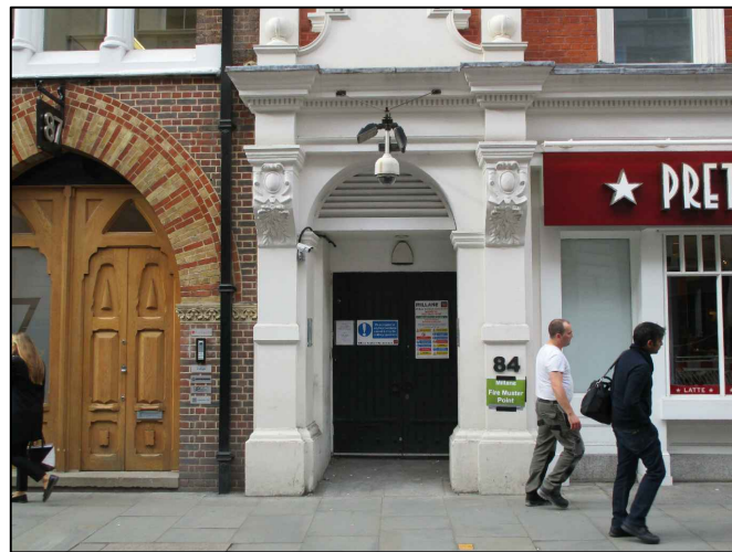
Photograph showing entrance to be altered