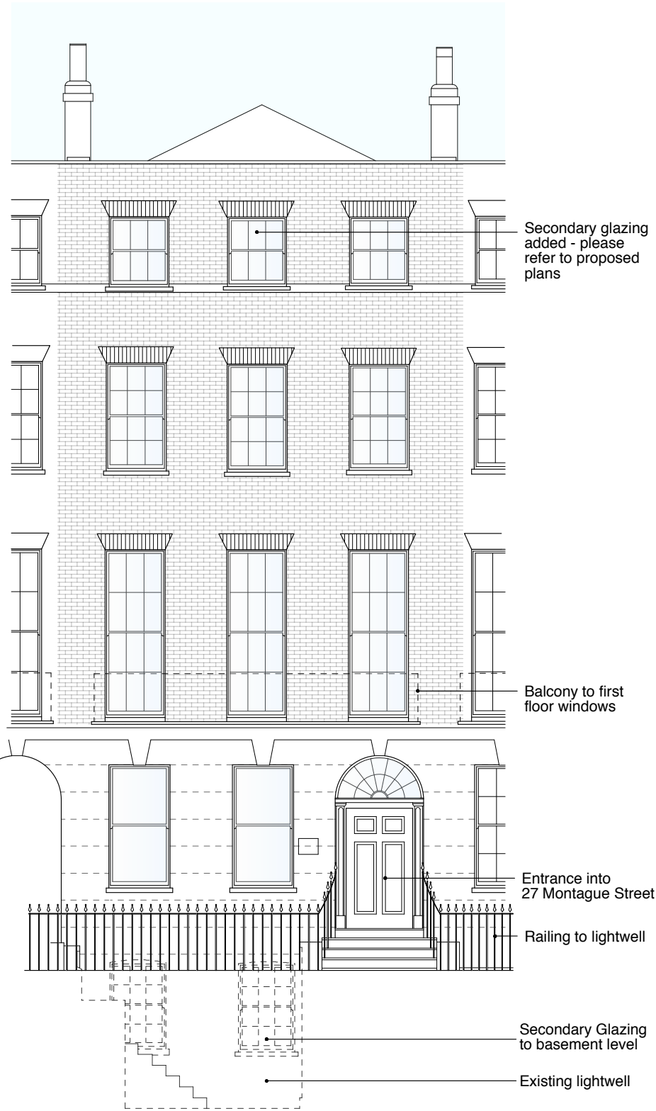
FRONT ELEVATION A NO CHANGES TO FRONT ELEVATION