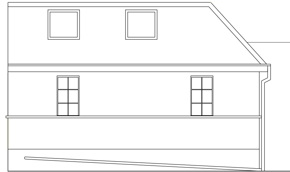
4 South Elevation