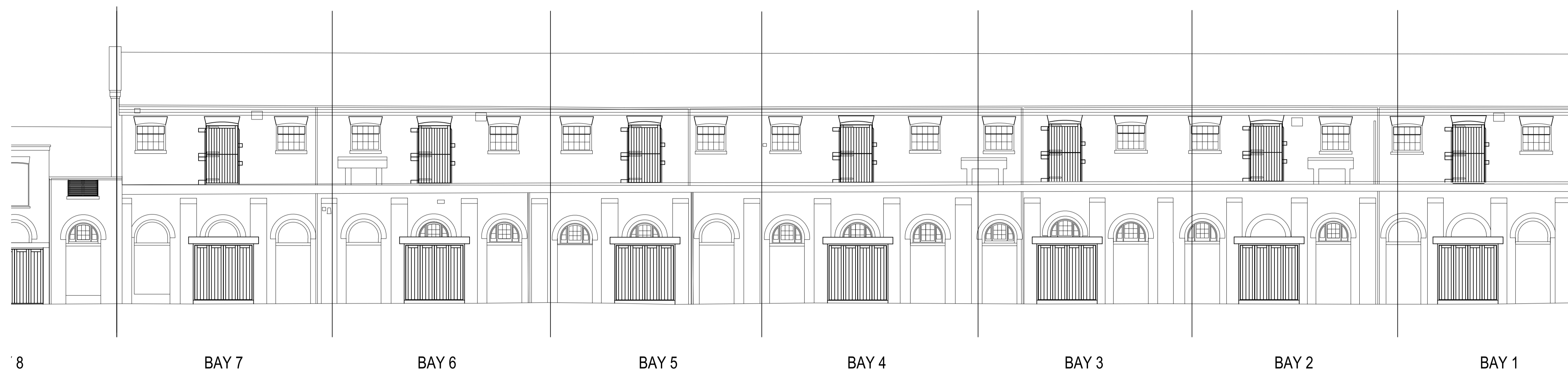
South Elevation (Chalk Farm Stables) Scale 1:100

Note: All structural opening sizes to be checked and confirmed prior to any manufacture.