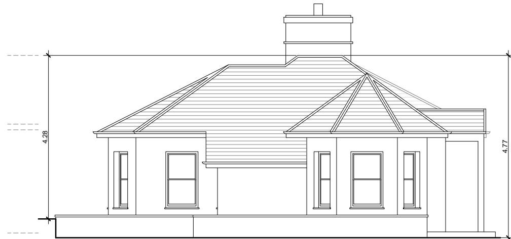
EXISTING NORTH SIDE ELEVATION