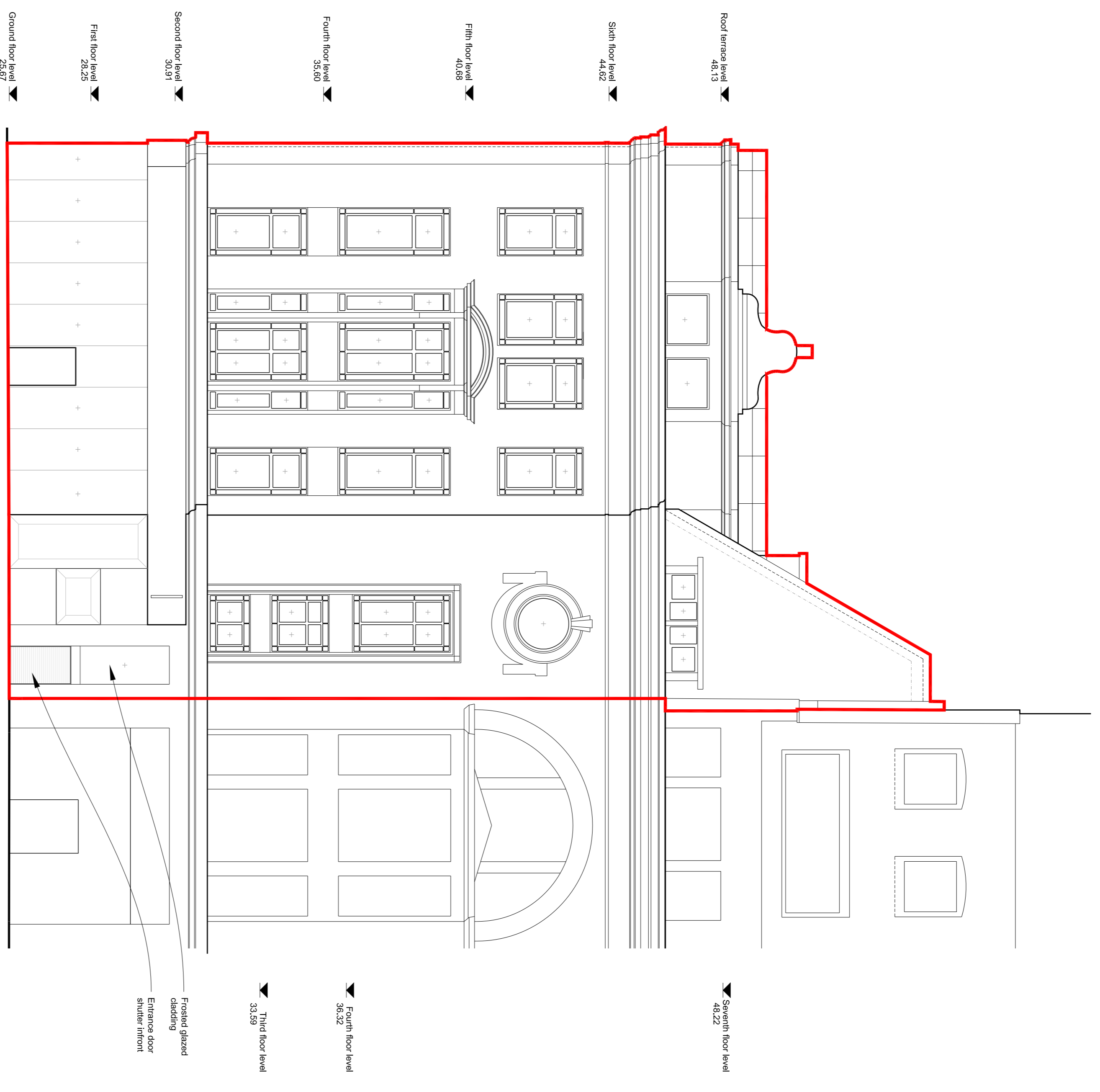
A ELEVATION EXISTING 1:100 @ A1 EX/00/019