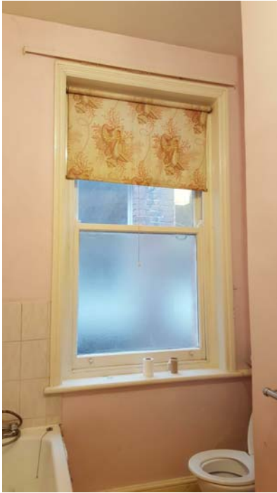
W04 (internal view)