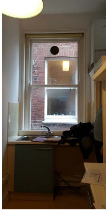
W05 (internal view)