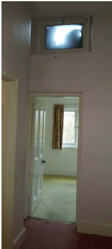
W10 (internal view)