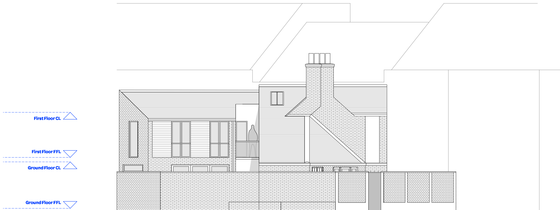
PROPOSED WEST ELEVATION FROM STREET