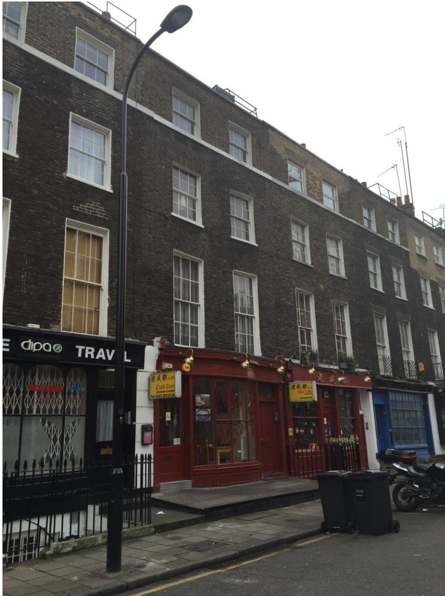
Picture of the building.