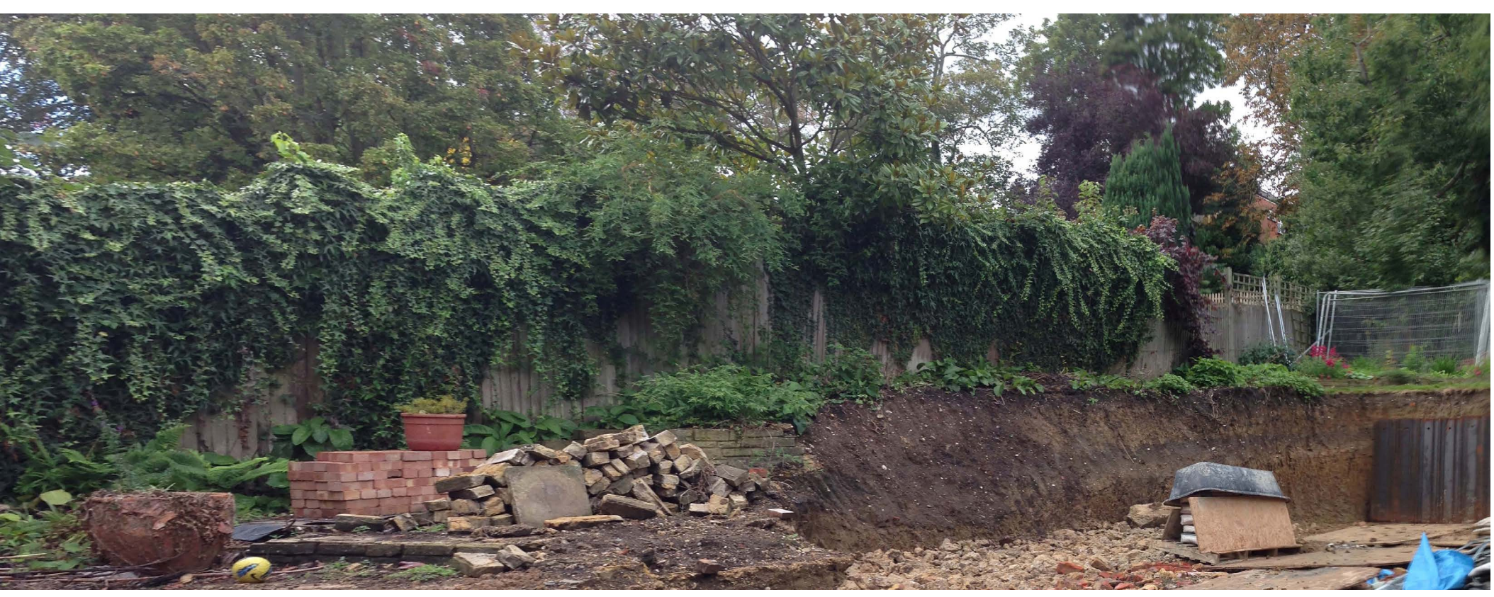
Existing timber fence