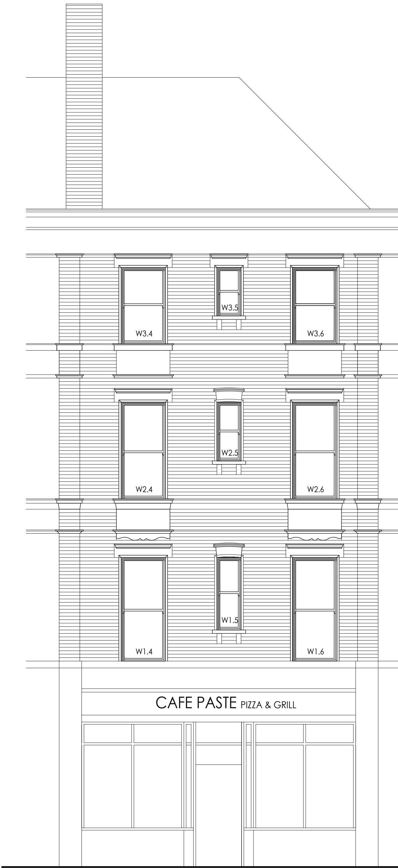
PROPOSED EAST (REAR) ELEVATION (FRONTS ONTO MONMOUTH STREET)