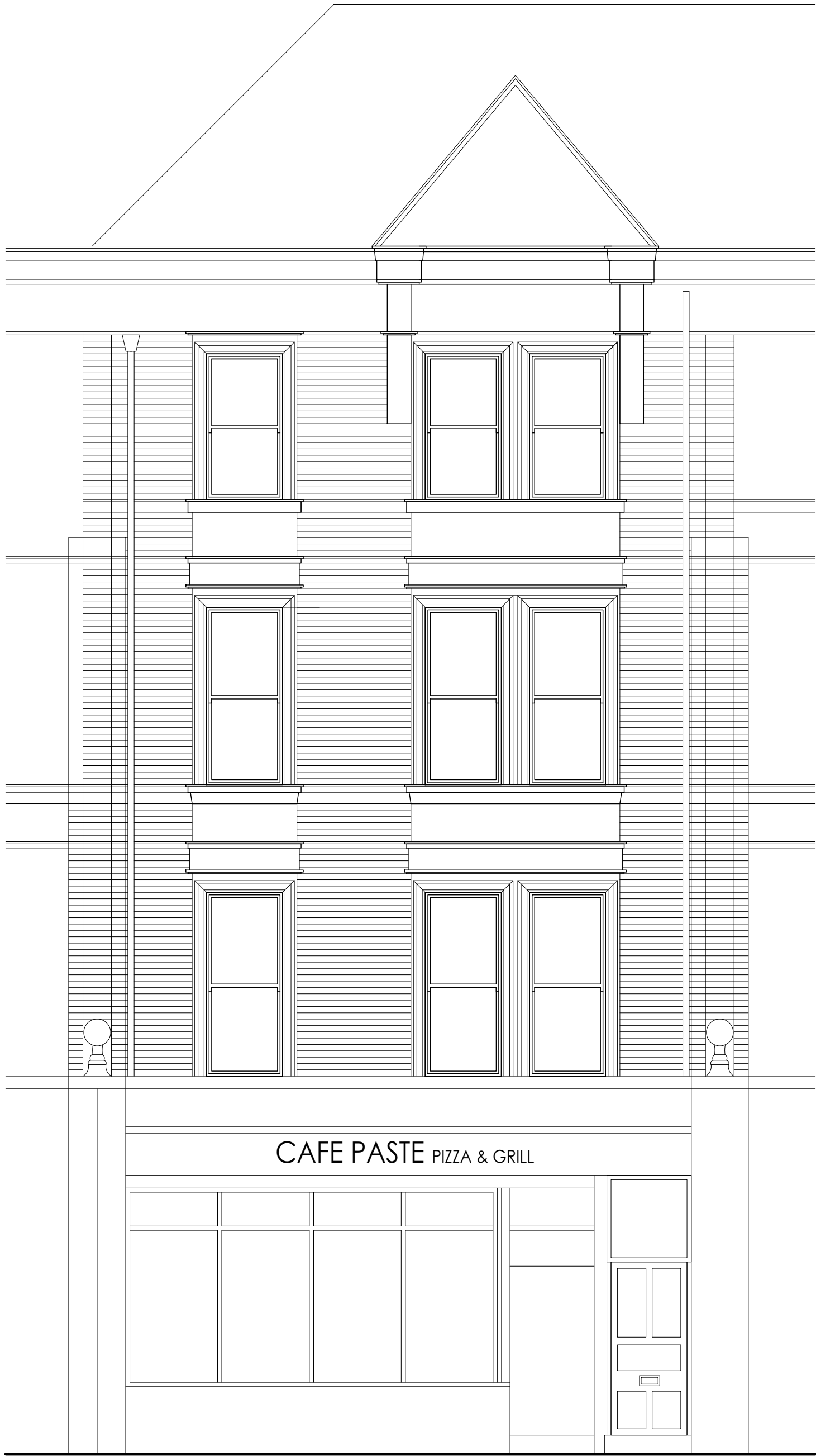
EXISTING NORTHWEST (FRONT) ELEVATION (FRONTS ONTO SHAFTSBURY AVENUE)