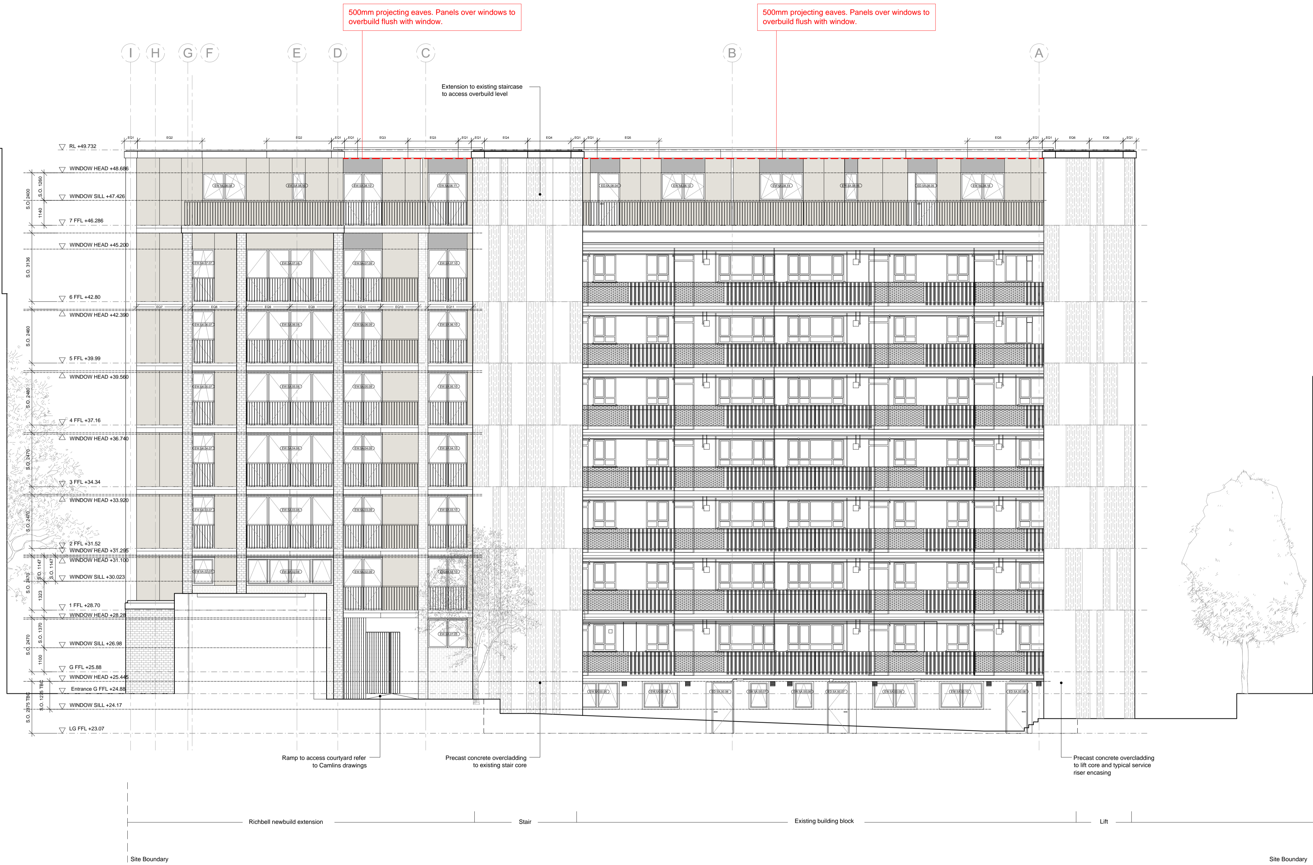
NE Elevation to Courtyard

©Avanti Architects Ltd www.avantiarchitects.co.uk 361-373 City Road + 44 (0) 20 7278 3060 London EC1V 1AS aa@avantiarchitects.co.uk