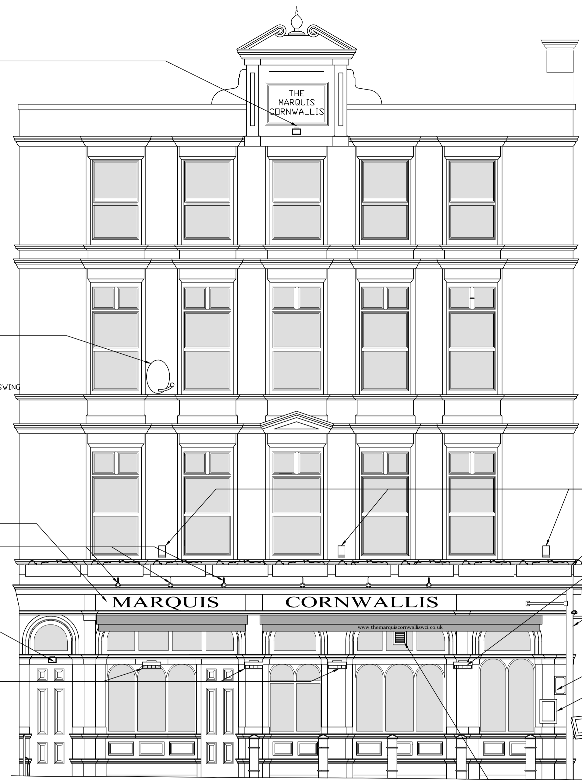
CORAM STREET EXISTING ELEVATION