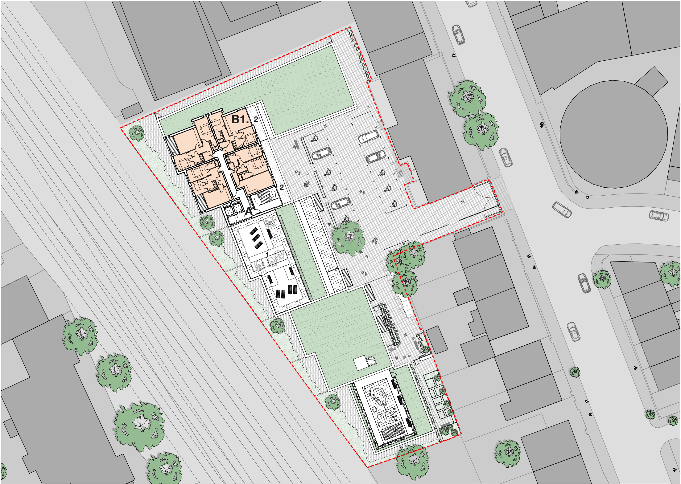
Proposed Level 06