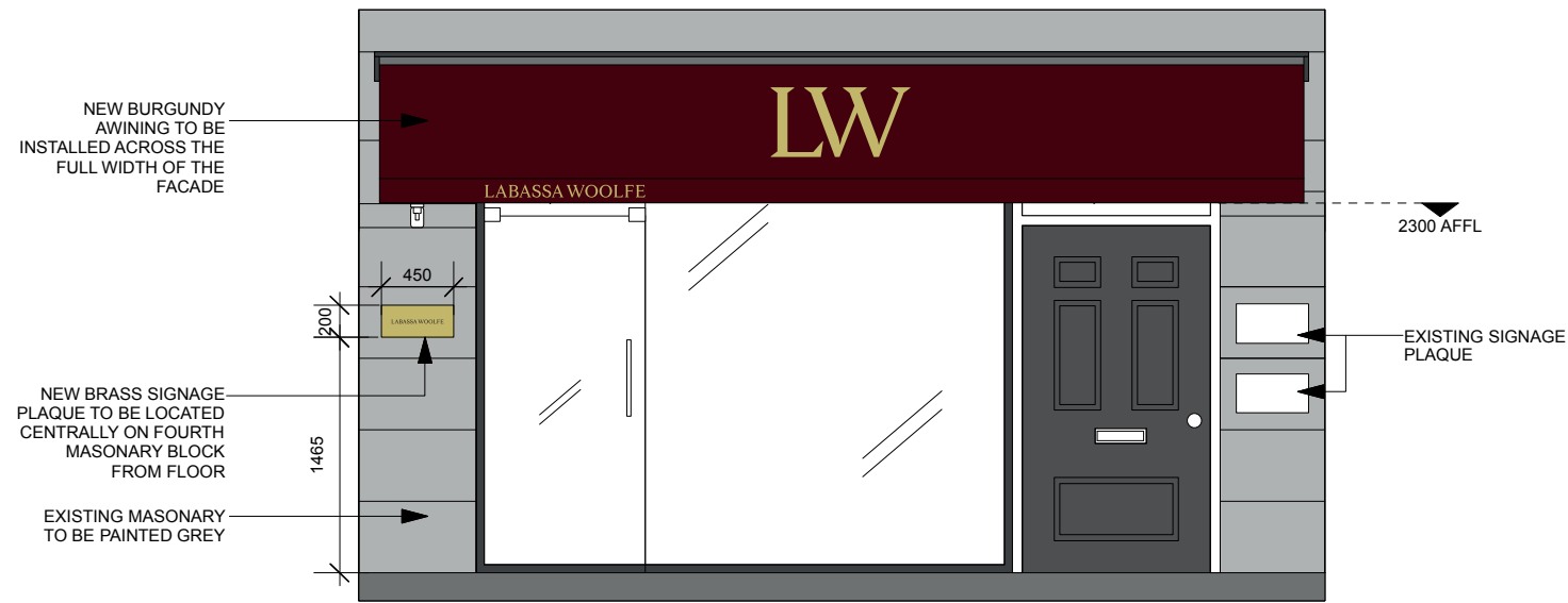
PROPOSED ELEVATION - AWNING DOWN

01 SCALE @ A3 - 1:50 (BOLD SCALE DENOTES DRAWING PRINT FORMAT)