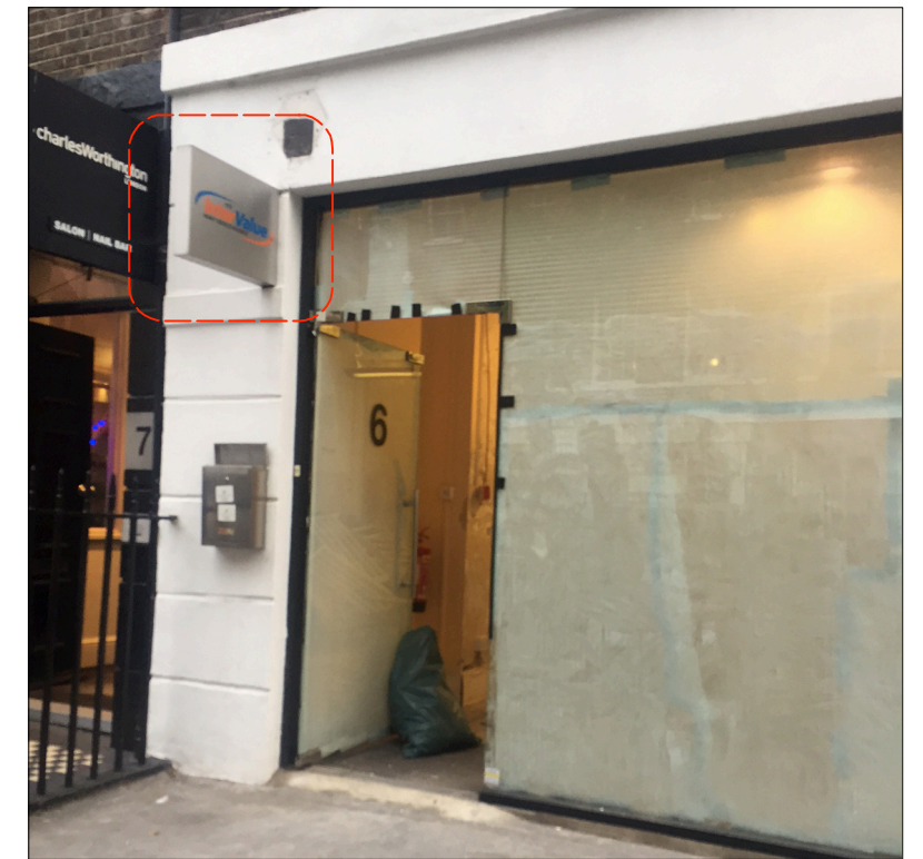
EXISTING SIGNAGE TO BE REMOVED