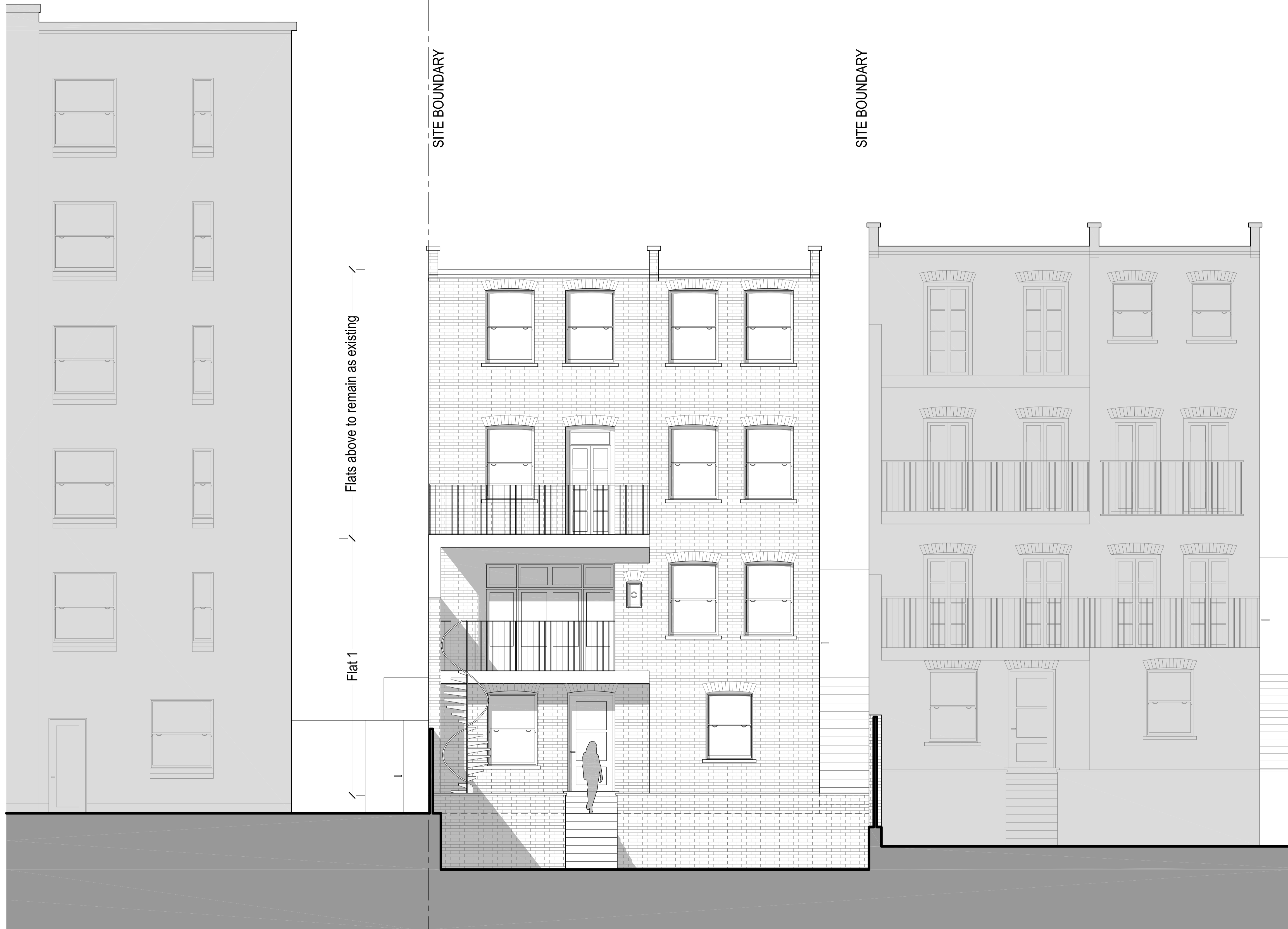
Existing Rear Elevation Scale 1:50