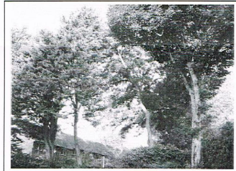
Image of rear of property with T4 to the right, T5 in the central background and TG2 to the left.