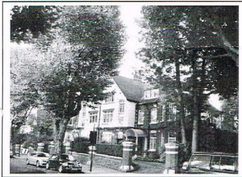
Image of front of property showing T1 on left and T2 on the right.