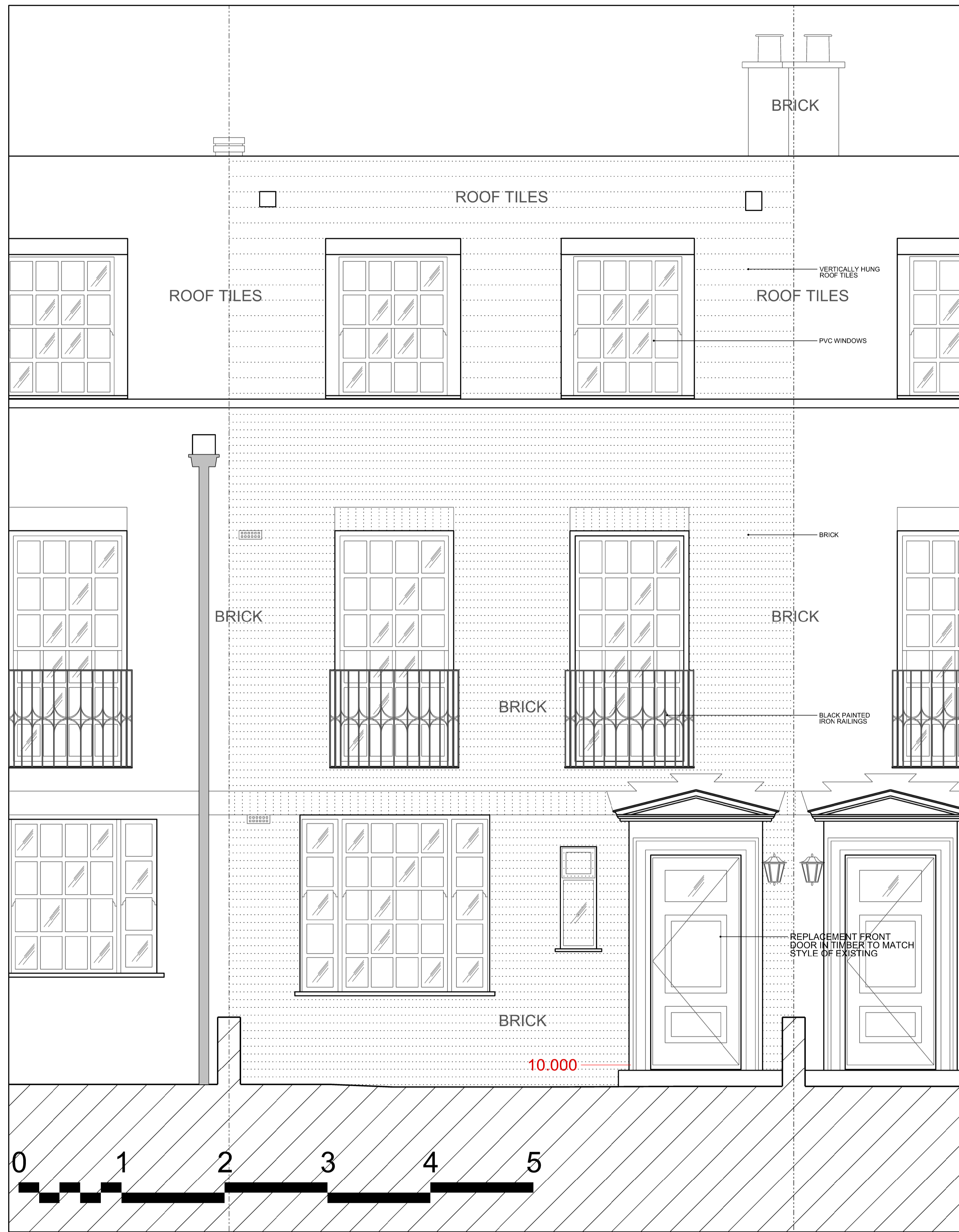
1 ELEVATION Front 1:25