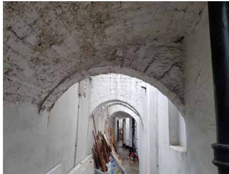
Quadrant vault to be removed