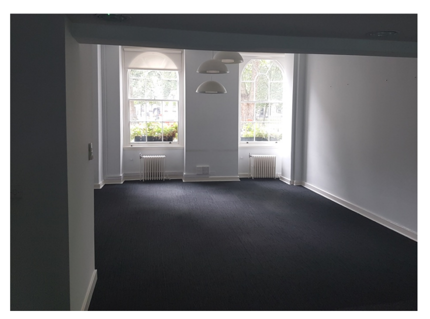
1. View to front elevation windows