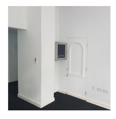
3. Blocked doorway