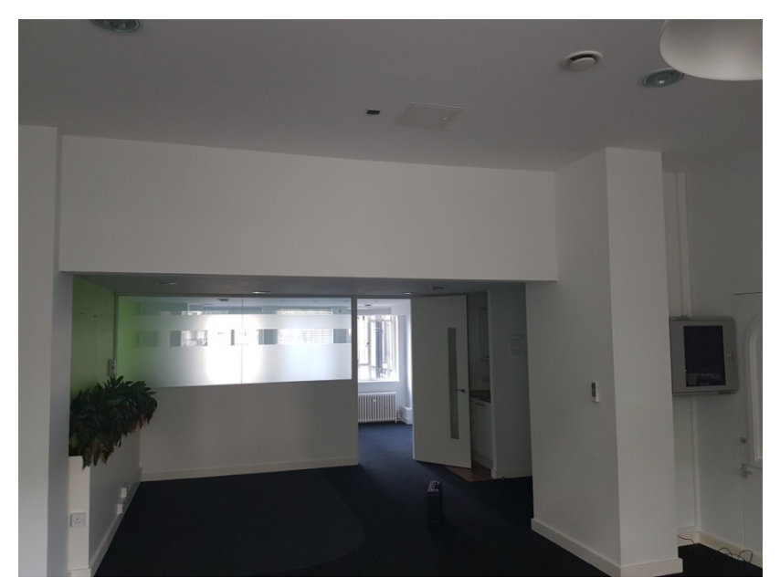
2. Towards rear area