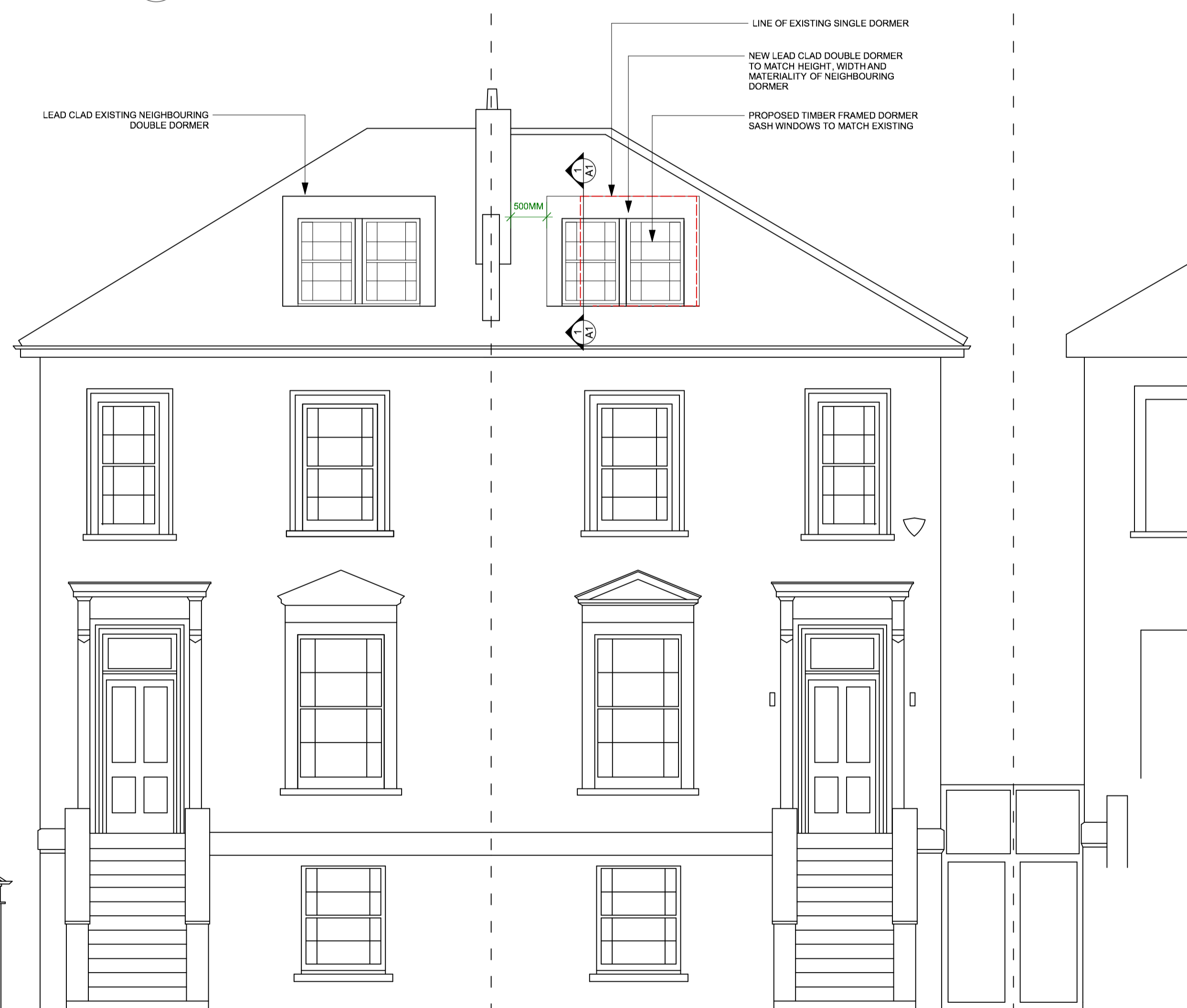
4 PROPOSED FRONT ELEVATION 1:50