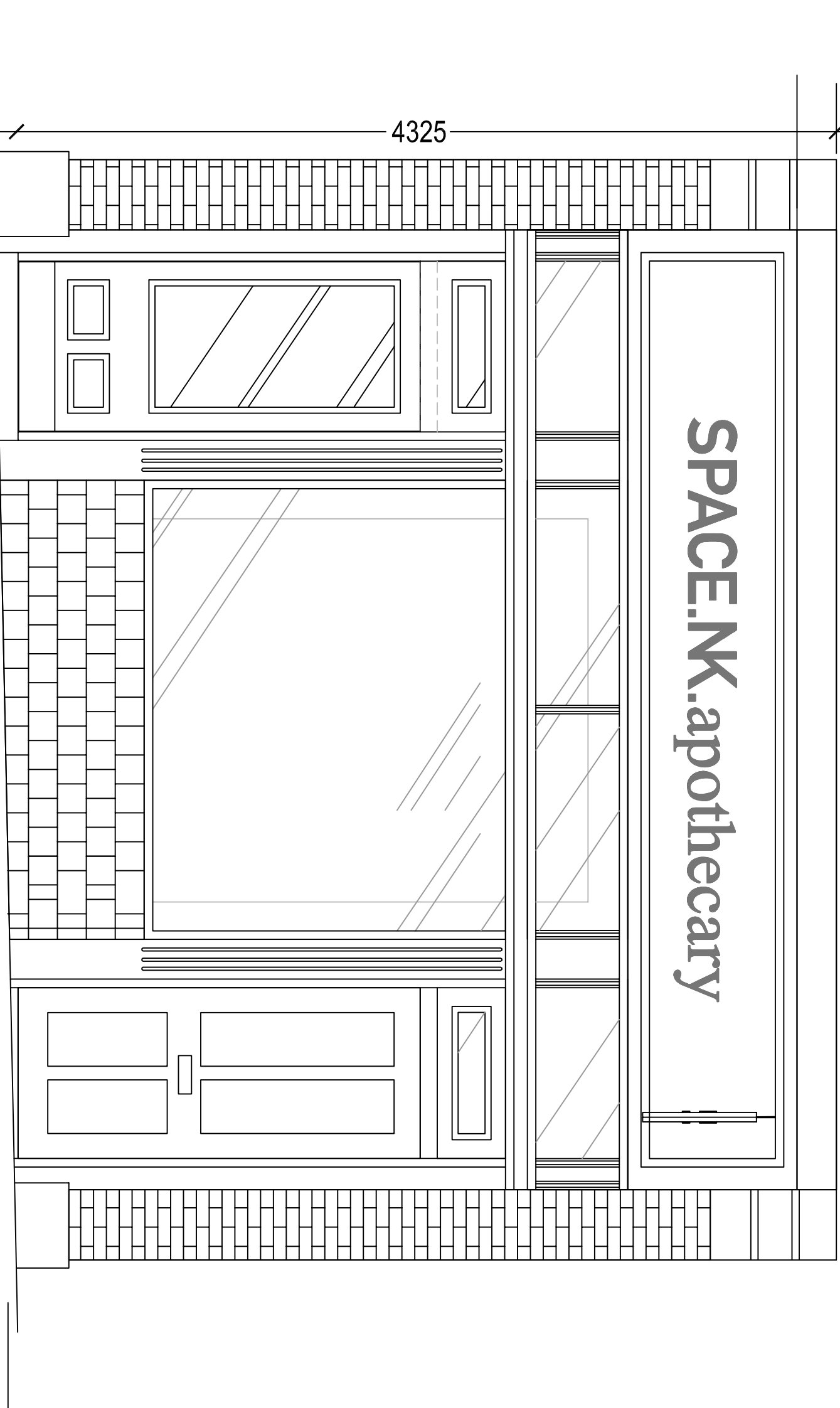
Shopfront Elevation As Existing | Scale 1:25 @ A1