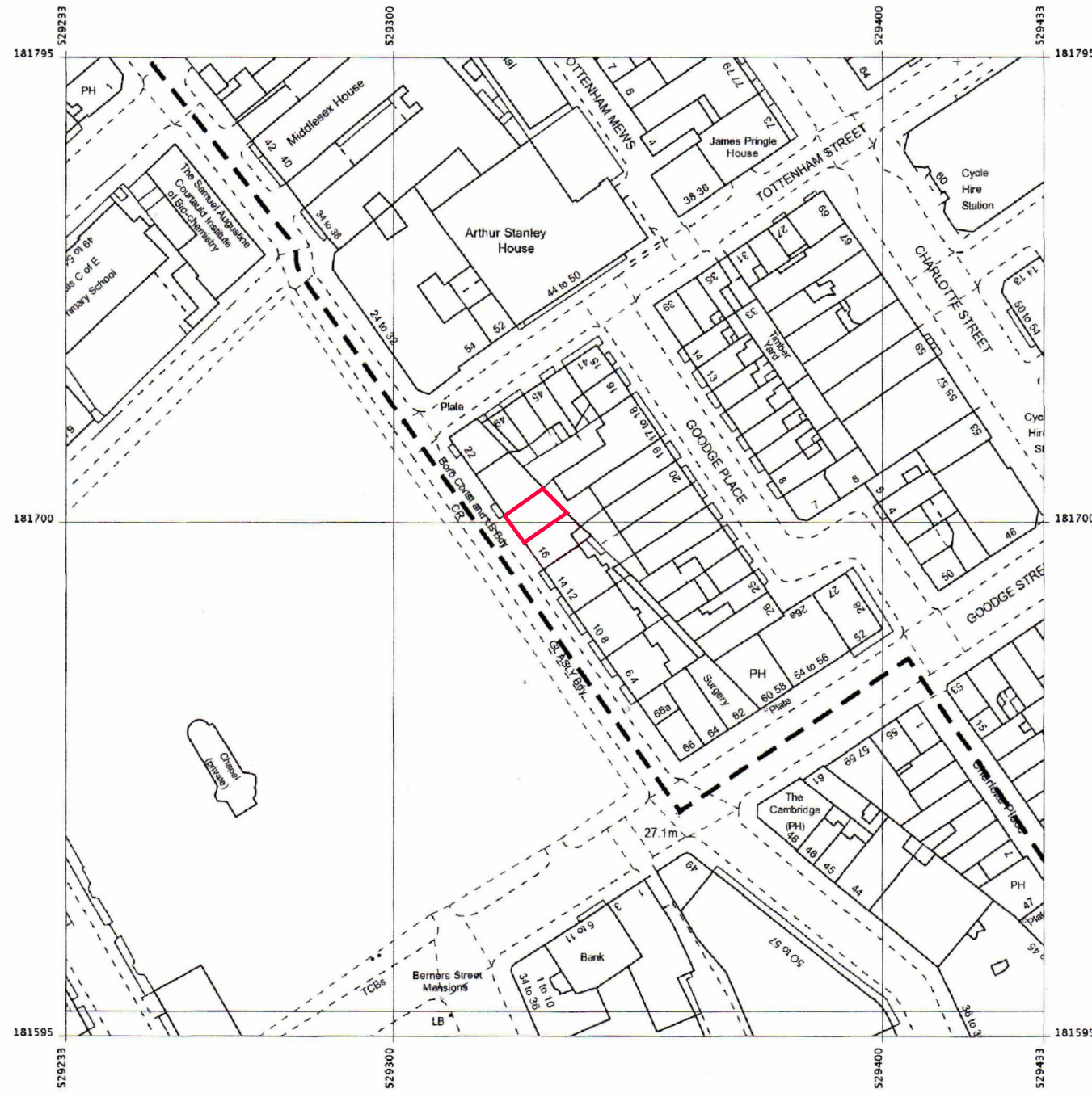
01 Site Location Plan 1:1250@A3