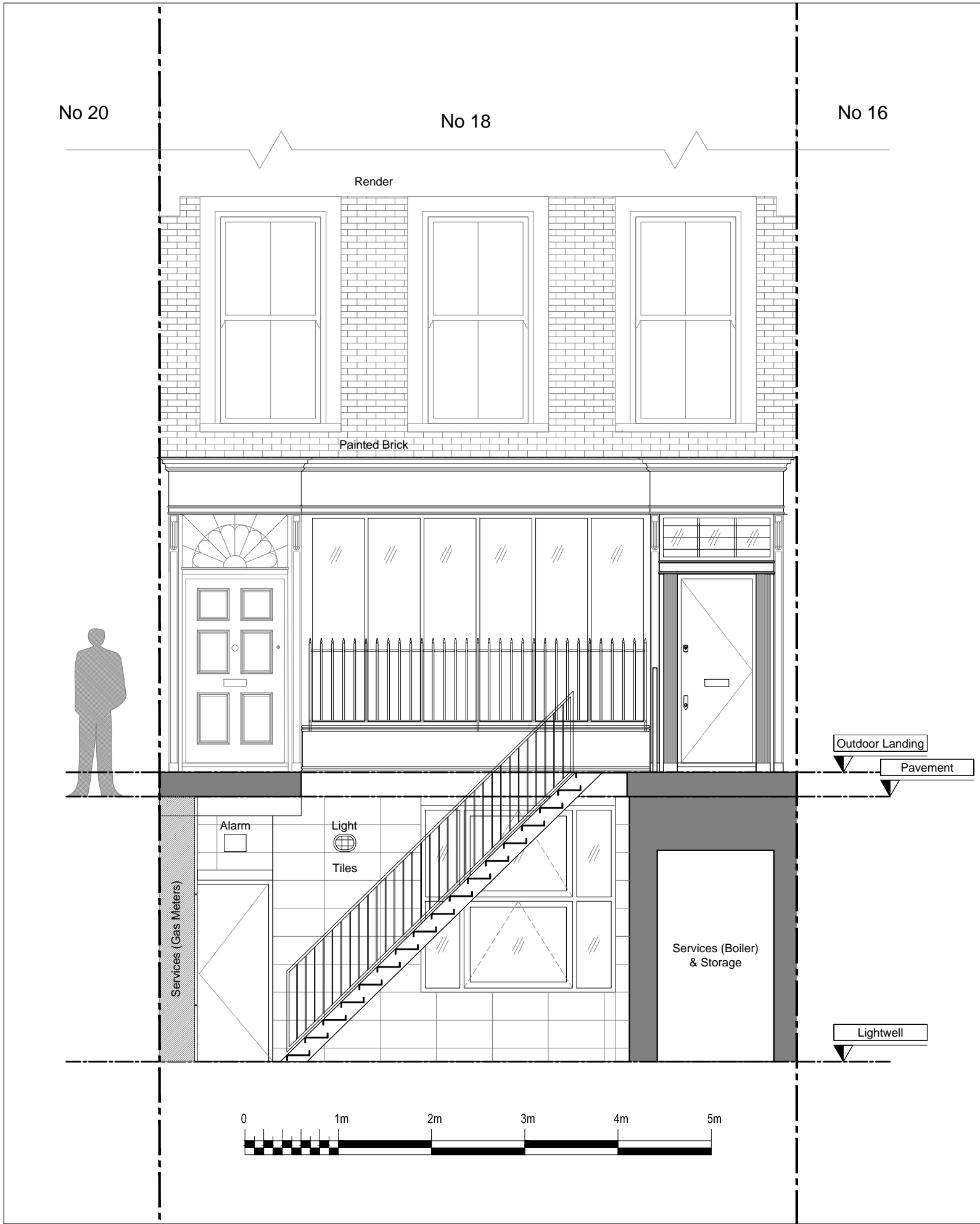
01 Elevation 1:50@A3