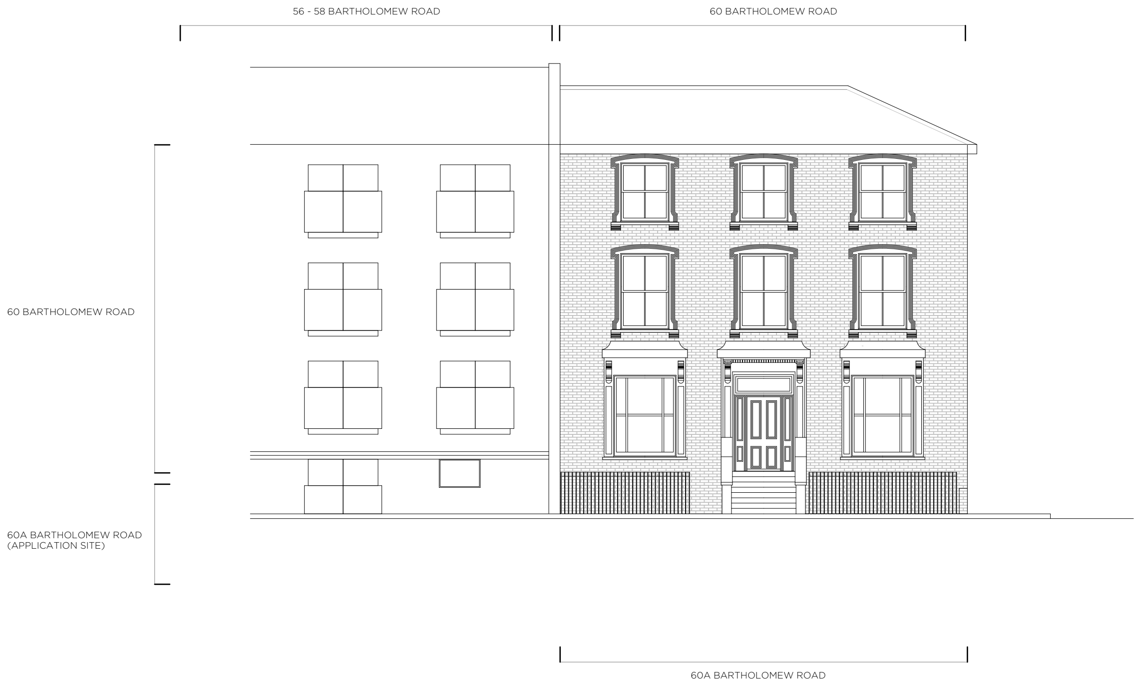
FRONT ELEVATION AS PROPOSED 1:100 at A3