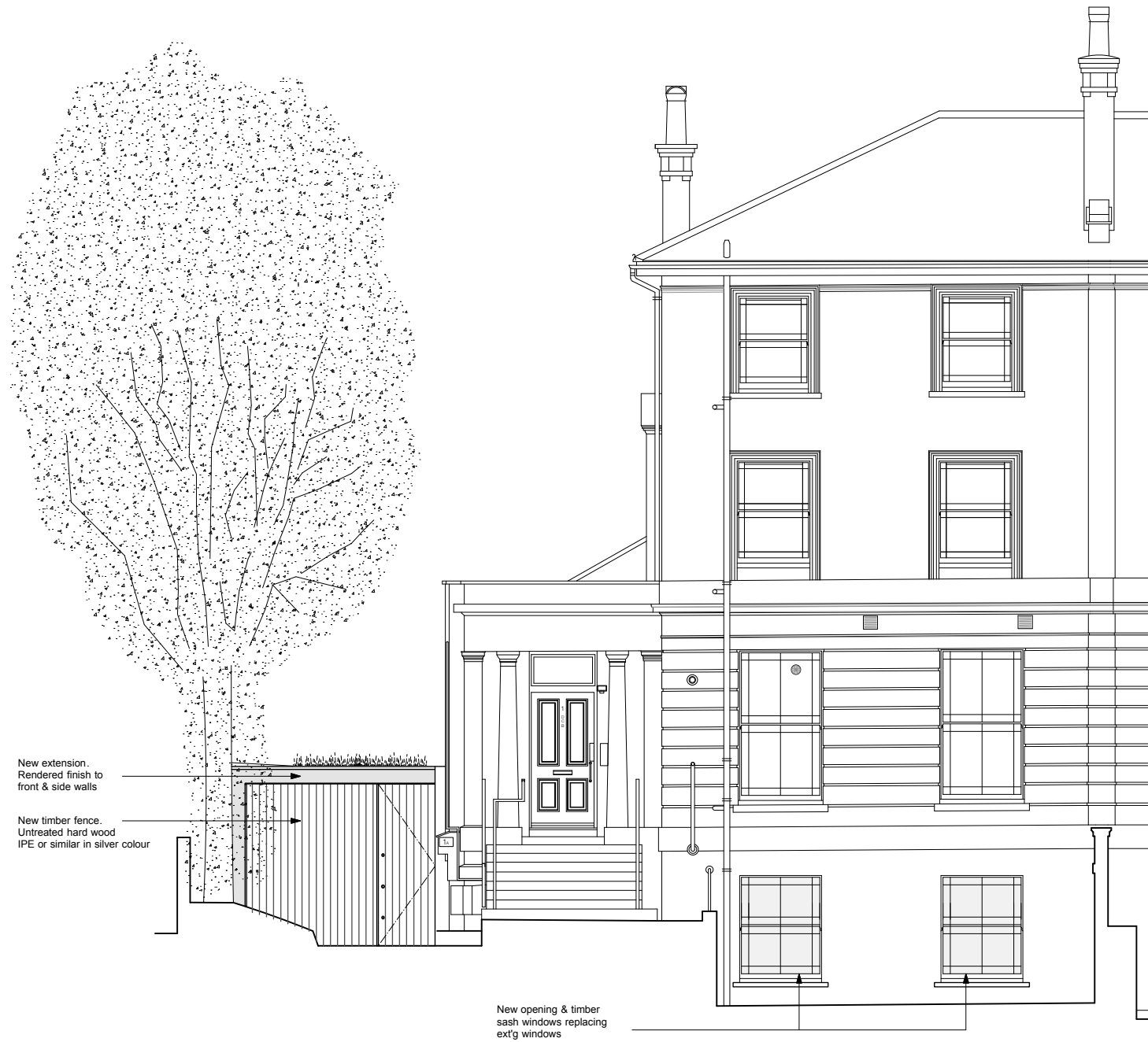
Proposed front elevation (Regents Park Road)

NOTE: The current proposal is only to refurbish Lower Ground level and to build a new extension.