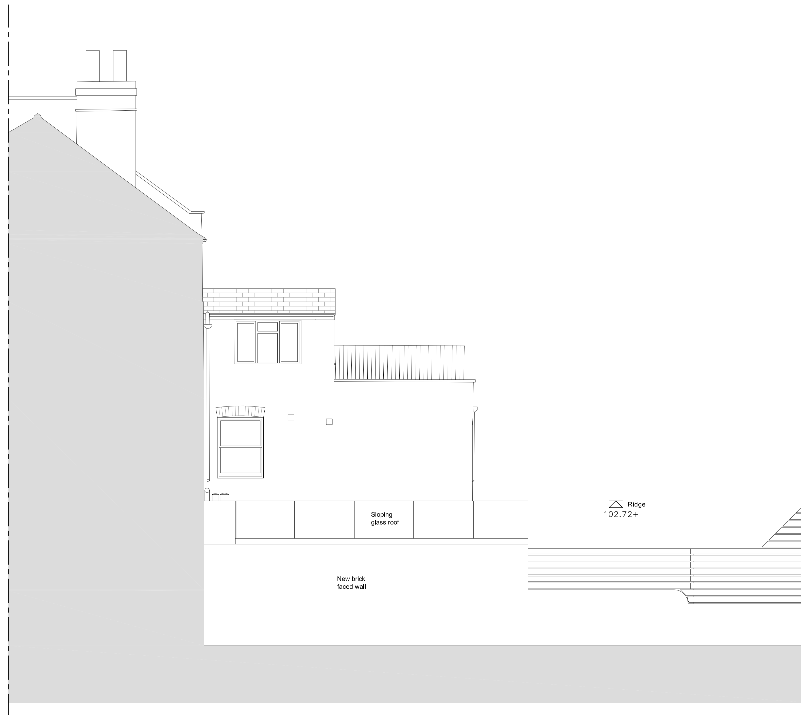
NEIGHBOURS VIEW ELEVATION

97.96+ ▽ BS FI Ref: SDA Drwg No. 251/PD/008