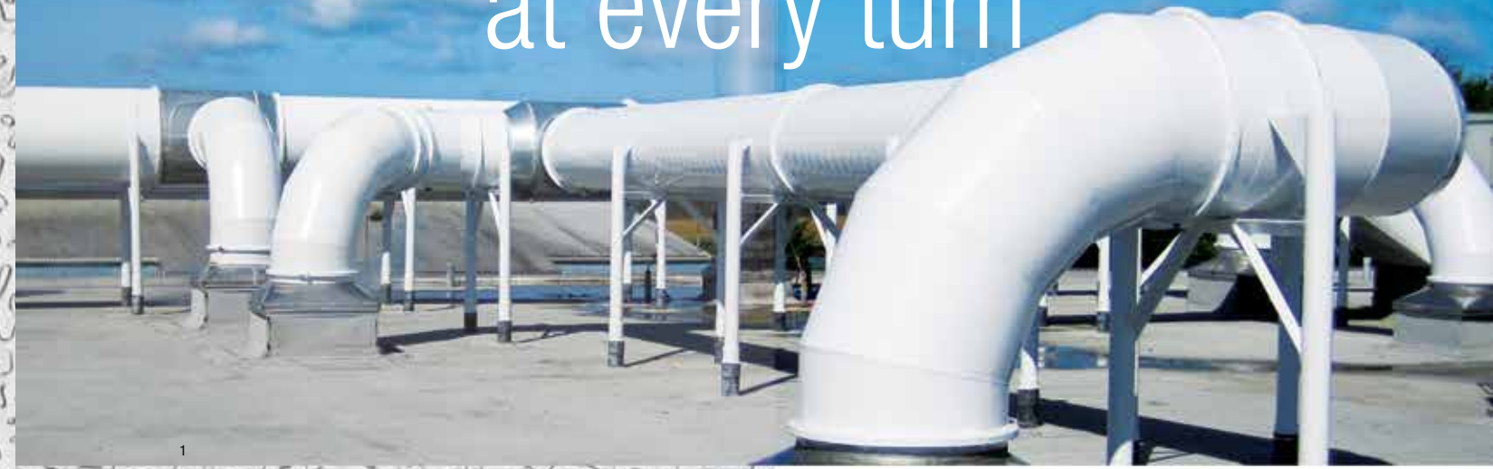
Building your Success on our Products