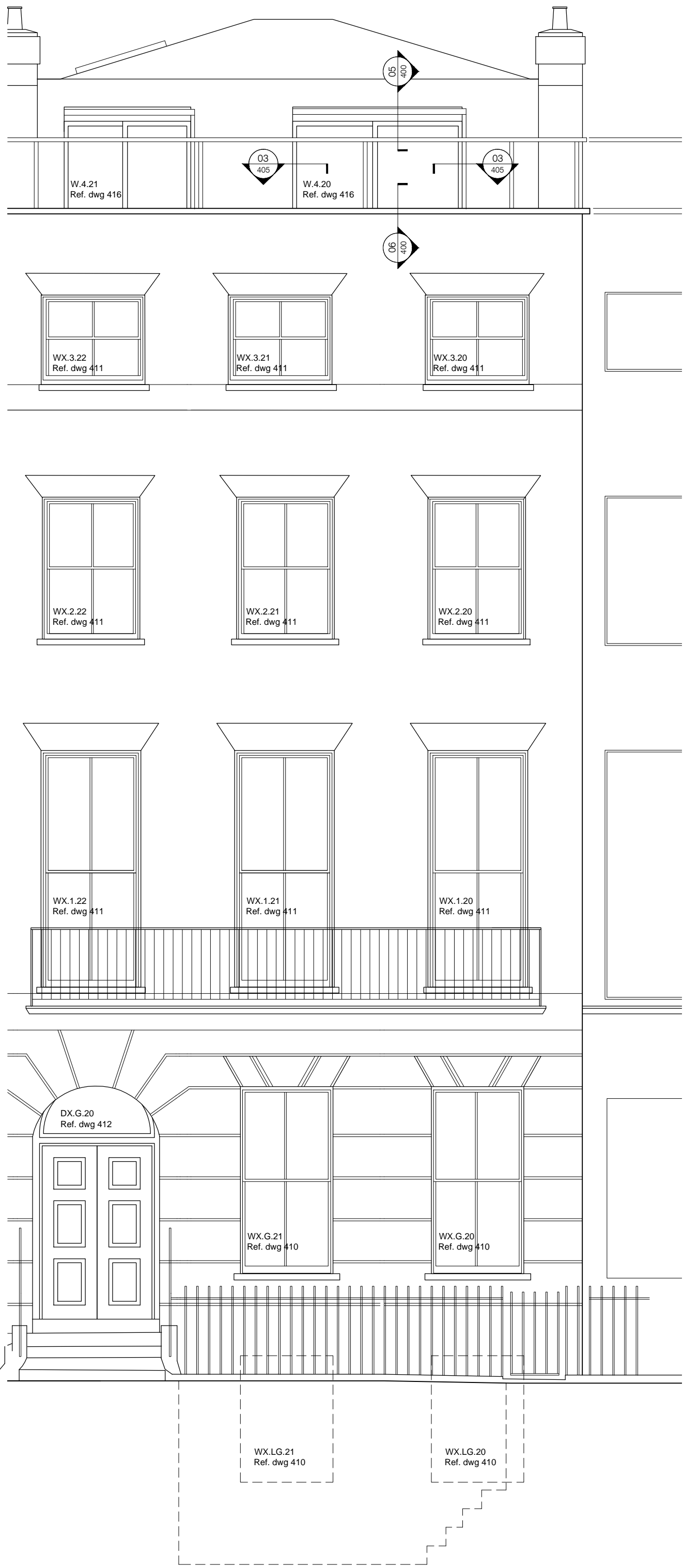
01 Proposed Front (South-east) Elevation 1:50 @ A1 (1:100 @ A3)