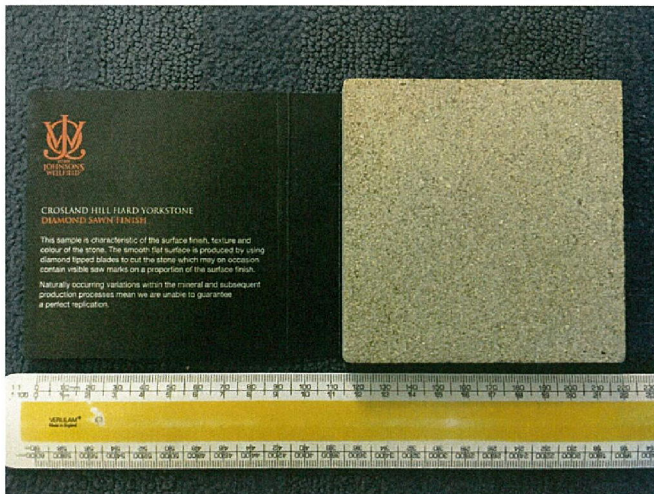
Image 3: Johnson Wellfield Sample - Yorkstone, Diamond Sawn Finish.