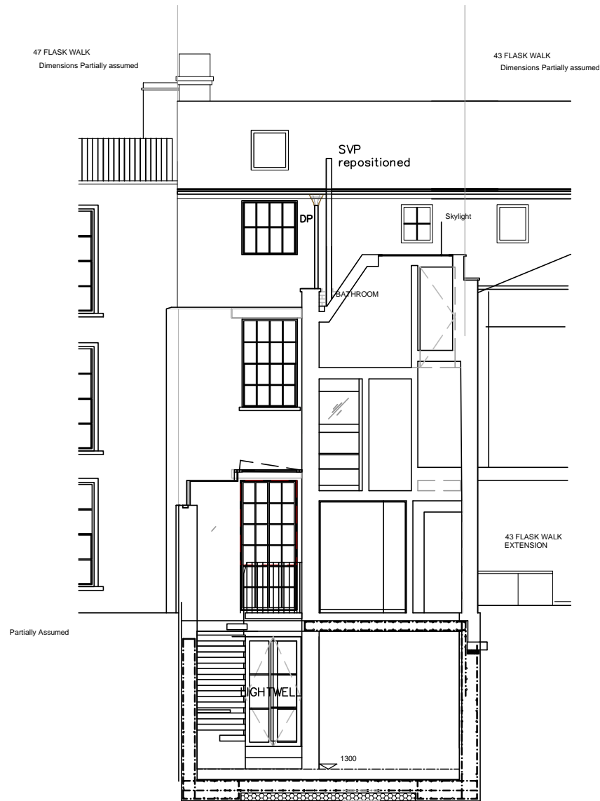
PROPOSED SECTION THROUGH DD Arbitrary Datum 0.00m